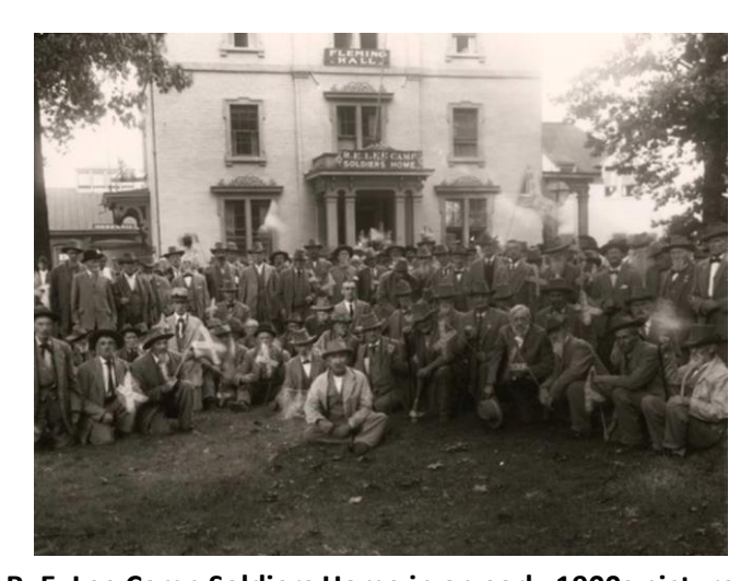
R. E. Lee Camp Soldiers Home in an early 1900s picture

On October 30<sup>th</sup>, the Camp sent a $100 donation to the Confederate War Memorial Chapel in Richmond. We have supported the chapel for several years by sending monies for them to use as needed. This is the chapel at the Confederate Soldiers Home in Richmond which is on the grounds now occupied by the Virginia Historical Society and the Virginia Museum of Art.