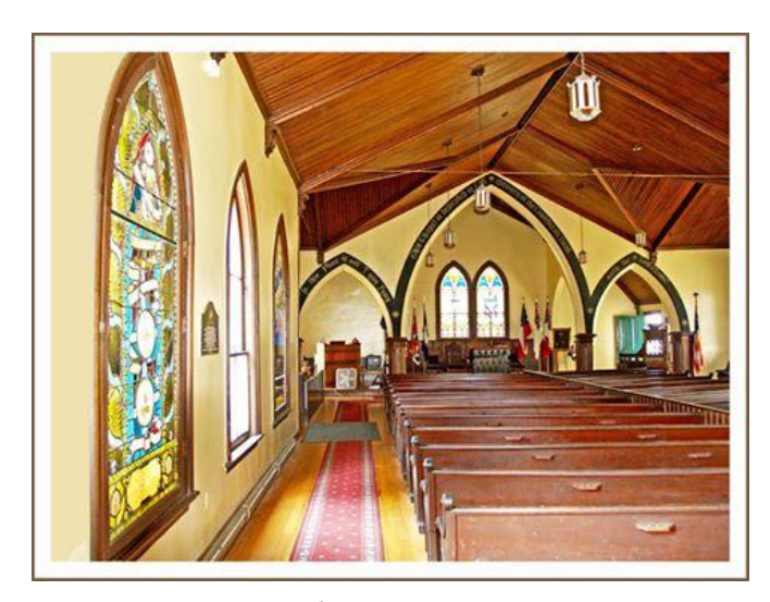
Interior of the Pelham Chapel