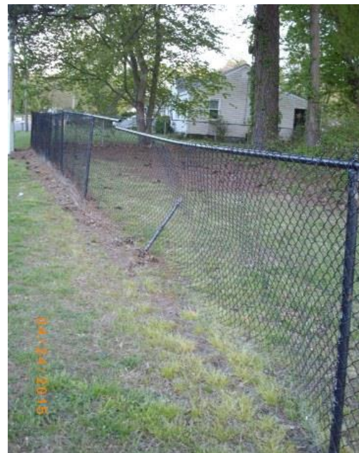
Roadside fence damage at Ft. Magruder