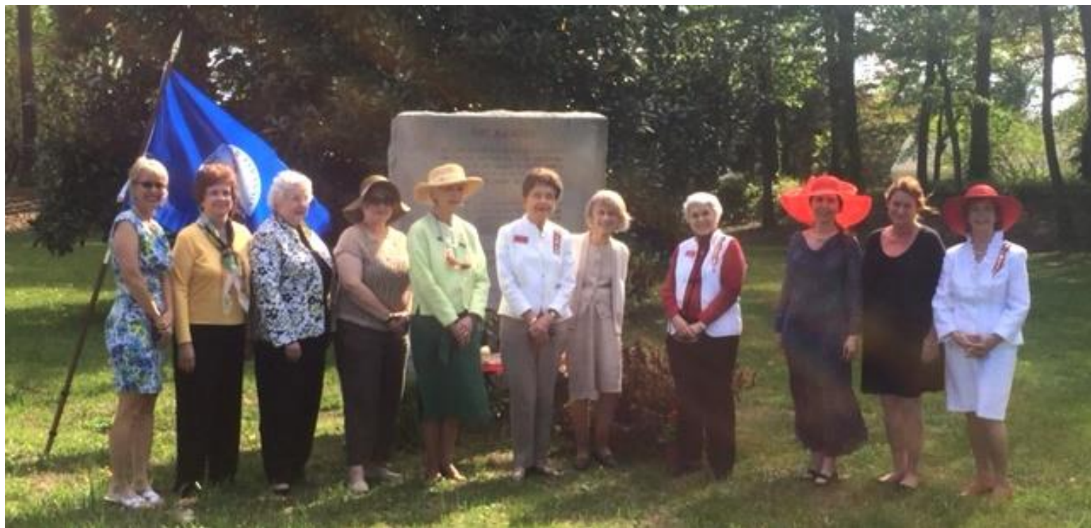
The Battle of Williamsburg Memorial Service, hosted by the Williamsburg Chapter #637 UDC, held on May 3 rd at Ft. Magruder. The Camp provided the Colors for the ceremony.