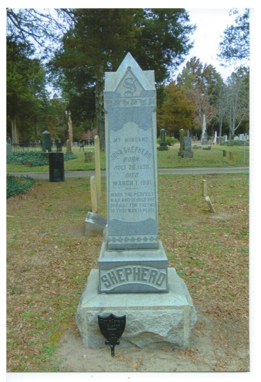
Shield Text: Confederate Veteran / Suffolk Chapter 173 U.D.C.