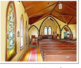
Interior View of Pelham Chapel

The Confederate War Memorial Chapel (Pelham Chapel) was dedicated to the "memory of the Confederate dead" in 1887. It was originally the part of Confederate Veterans Soldier's Home complex. Pelham Chapel was the site of funeral services for over 1700 Confederate Veterans.