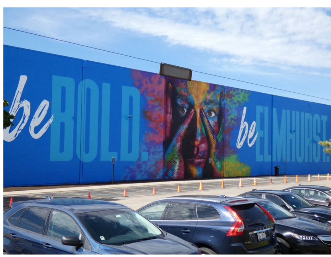
Elmhurst's newest public art is the mural "Be Bold Be Elmhurst" on the wall of Elmhurst University's R. A. Faganel Hall, facing north on Park Avenue west of Prospect Avenue.