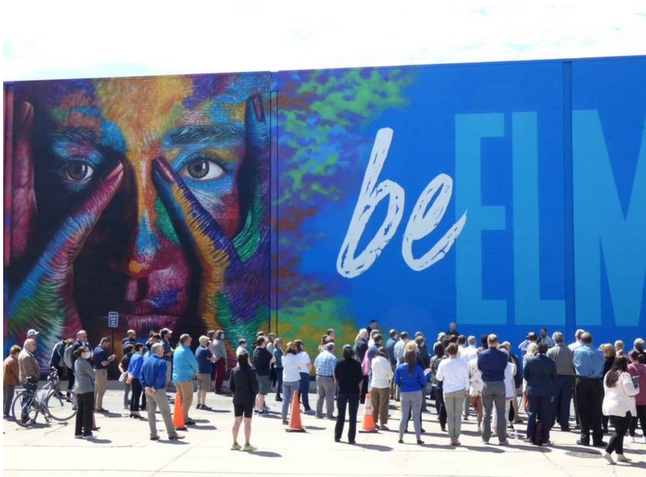
Elmhurst's newest public art is the mural "Be Bold Be Elmhurst" on the wall of Elmhurst University's R. A. Faganel Hall, facing north on Park Avenue west of Prospect Avenue. People from the community and the school attended the Tuesday celebration of a mural in Elmhurst.

Elmhurst University officials were joined by city officials Tuesday (May 17) in a ceremony marking completion of the city's first mural, painted on the north-facing wall of the school's R.A. Faganel Hall on Park Avenue west of Prospect Avenue.