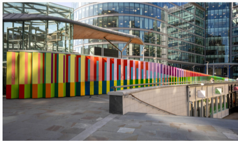
Pop Pop Pop