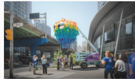
Trekker, Tinker, and Trouper

Boom Town, a public art display along Toronto's Bentway, dresses up boom lifts as silly creatures