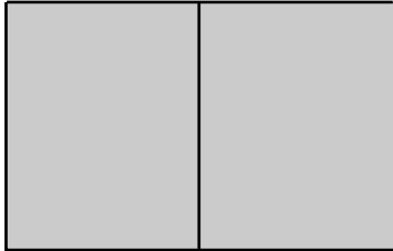
___ Full Spread 17" x 11" $800