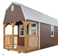
Lofted Barn Cabin