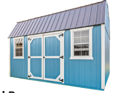
Side Lofted Barn