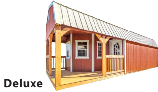
Deluxe Lofted Barn Cabin