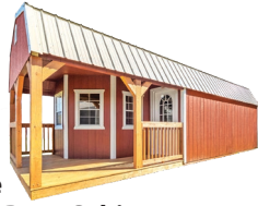
Deluxe Lofted Barn Cabin