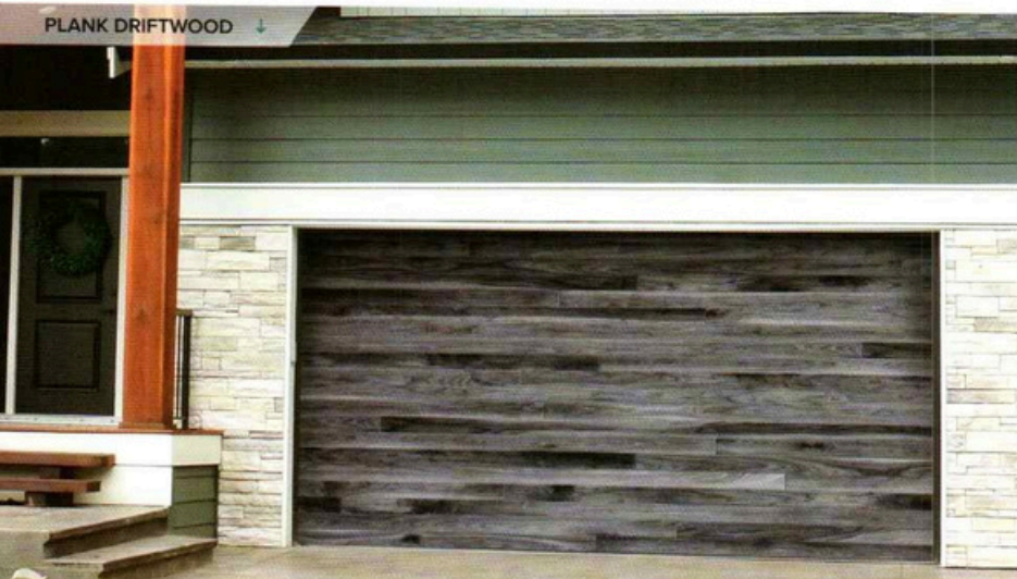
PLANK DRIFTWOOD ↓

View all the specs for this door online at doorLinkmfg.com