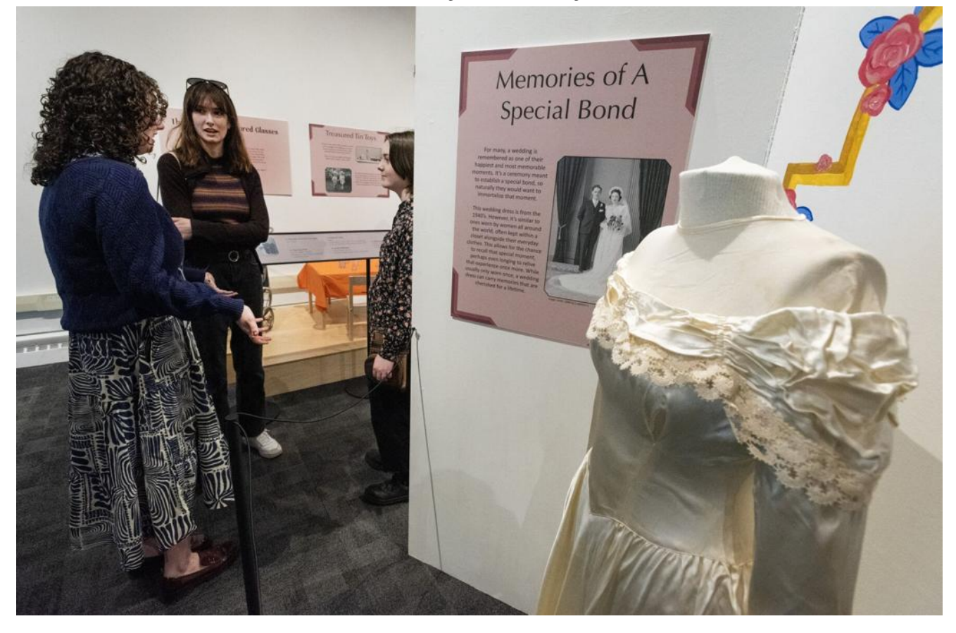
The Peterborough Museum and Archives hosted a new temporary exhibit, "Collecting Memories: Objects that Define Us," curated by students from Fleming College's museum management and curatorship program. The exhibit explores a fresh perspective on storytelling through objects.

Exhibit explores connection to past, memories and stories