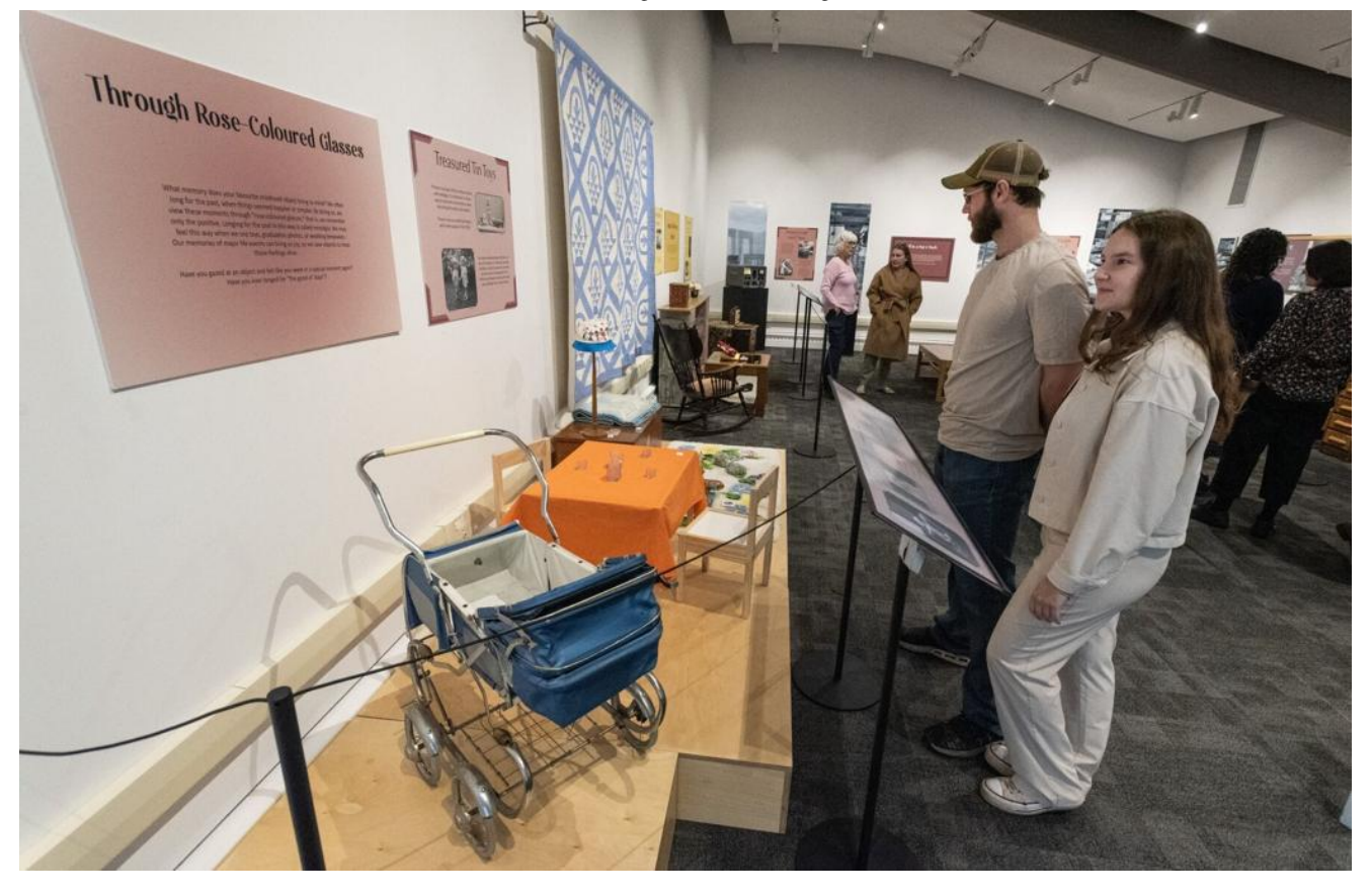
Exhibit explores connection to past, memories and stories

The Peterborough Museum and Archives hosted a new temporary exhibit, "Collecting Memories: Objects that Define Us," curated by students from Fleming College's museum management and curatorship program. The exhibit explores a fresh perspective on storytelling through objects.