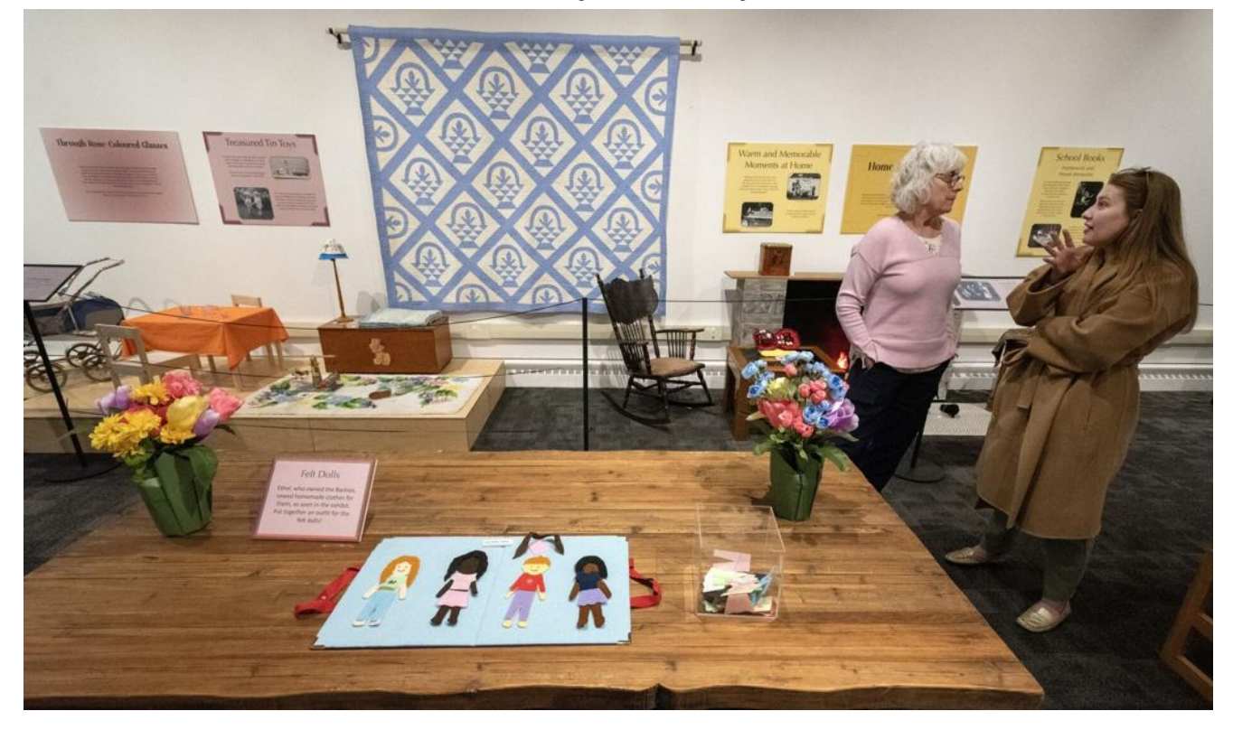
The Peterborough Museum and Archives hosted a new temporary exhibit, "Collecting Memories: Objects that Define Us," curated by students from Fleming College's museum management and curatorship program. The exhibit explores a fresh perspective on storytelling through objects.

Exhibit explores connection to past, memories and stories