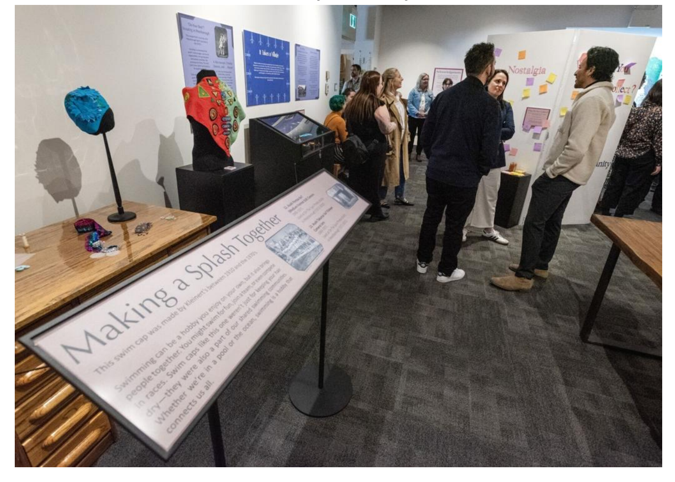
The Peterborough Museum and Archives hosted a new temporary exhibit, "Collecting Memories: Objects that Define Us," curated by students from Fleming College's museum management and curatorship program. The exhibit explores a fresh perspective on storytelling through objects.