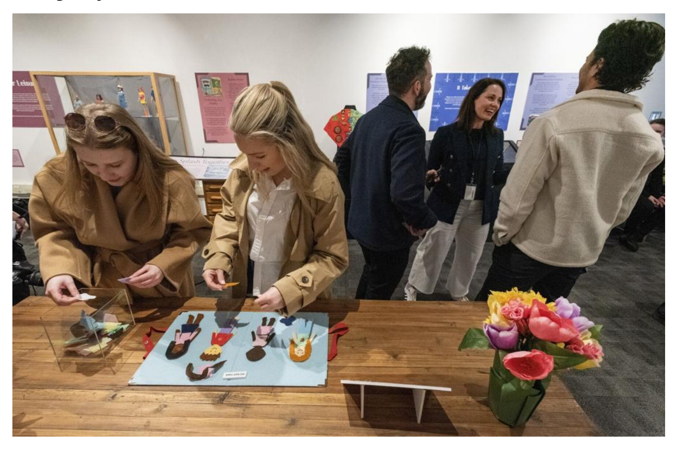
The Peterborough Museum and Archives hosted a new temporary exhibit, "Collecting Memories: Objects that Define Us," curated by students from Fleming College's museum management and curatorship program. The exhibit explores a fresh perspective on storytelling through objects.

Fleming College students, in partnership with the Peterborough Museum and Archives, have created an exhibit that explores a fresh perspective on storytelling through objects.