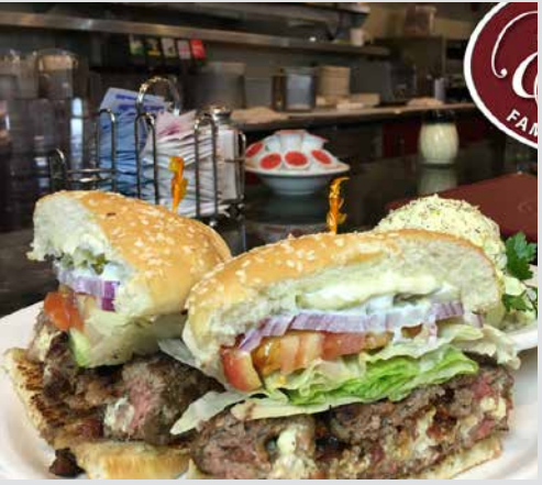
Stuffed Bacon Cheddar Burger (8oz) USDA Choice Ground Chuck stuffed with Bacon and Cheddar Cheese 15.00