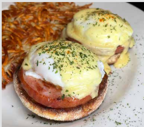
Eggs Benedict with Canadian Bacon 15.95

Served with 2 Poached Eggs And Hollandaise Sauce on an English Muffin only with Hash Browns, Home Fries or Cup Fruit.