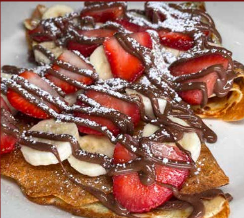
Nutella Crepes Thin French- Style Pancake filled with Sweetened Hazelnut Cocoa Nutella Spread topped with Fresh Straberries, Bannas, Whipped Cream and Nutella Drisseled on Top 14.50