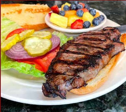
Steak Sandwich USDA Choice (8oz) New York Steak on a French Roll 19.95