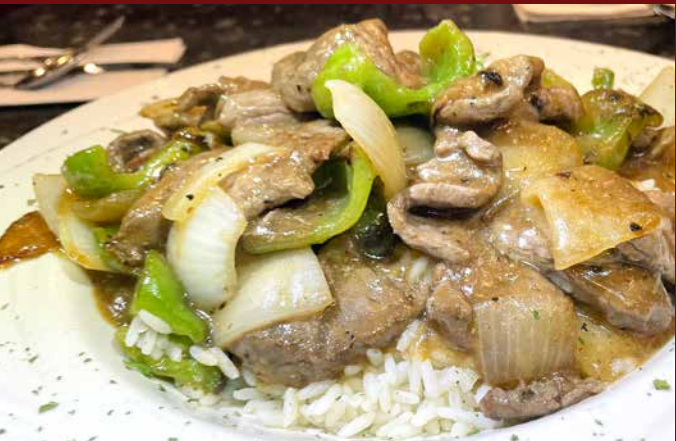
Wednesday Elios Pepper Steak Sauteed Bell Pepper and Onions in Elios Sauce. Served over a Bed of Rice 18.95