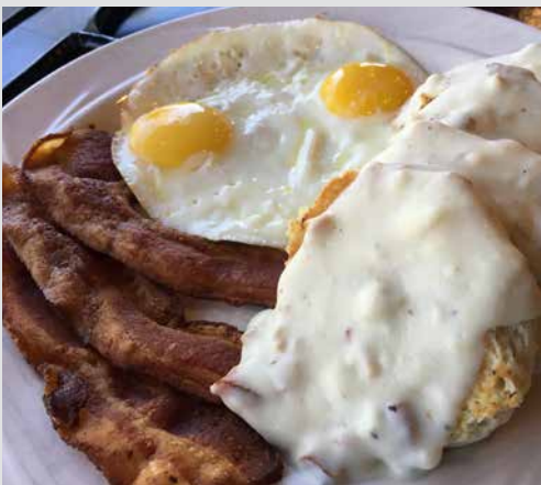
Country Style Biscuits And Gravy With Two Eggs, Bacon or Country Sausage 15.25 (Hash Browns and Home Fries Not Included)