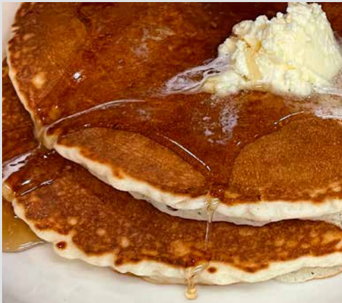
Buttermilk Pancakes Stack of Two 9.25