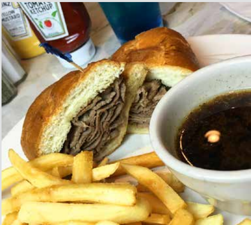
French Dip Au Jus Roasted USDA Choice Top Round Deli Sliced Served on French Roll with Au Jus 15.50