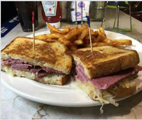
Reuben Fresh Corned Beef Served with Swiss Cheese and Sauerkraut on Rye 14.00