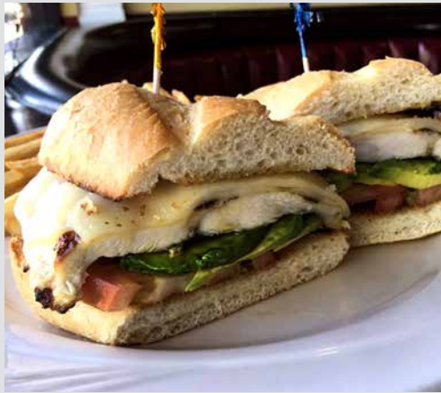
California Chicken Broiled (8oz) Chicken Breast topped with Jack Cheese, and Avocado on a French Roll 15.00

Served with Lettuce, Tomato, Pickle And Onions. With Choice of French Fries, Potato Salad, Green Salad, Cup of Soup, Fresh Fruit or Cole Slaw.