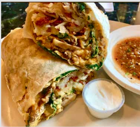
Breakfast Burrito With 3 Eggs, Chorizo, Avocado, Onions and Cheddar Cheese 15.50