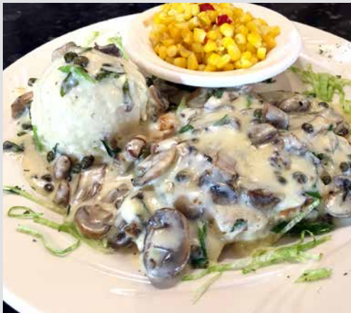
Chicken Piccata Boneless (8oz) Chicken Breast Sautéed with Fresh Mushrooms, Green Onions, Garlic, Lemon Butter Wine Sauce and Capers 18.50

All Dinners Include Choice of Soup or Salad. 2nd Choice: Rice, Spaghetti, Baked Potato, Fries or Cup of Fruit. All items Served with Vegetables