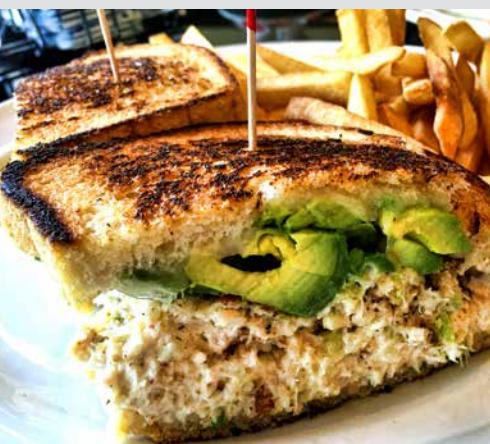
Grilled Crab Avocado and Swiss Cheese 18.75