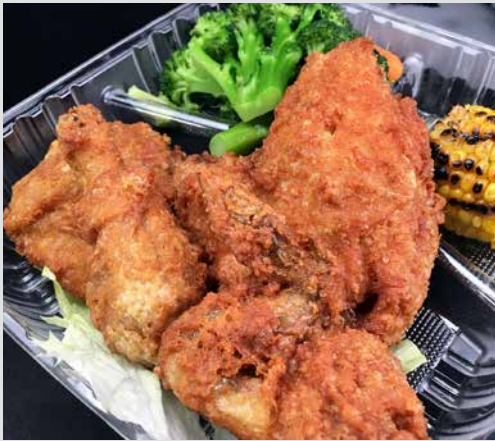
Fried Chicken Quartered 1/2 Chicken, Honey Stung and Golden Fried 16.95