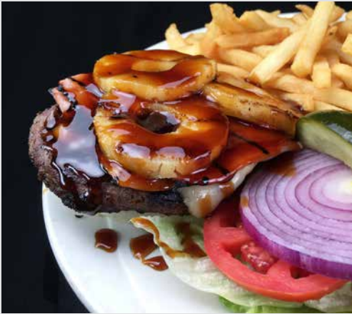
Hawaiian Burger Teriyaki Glaze, Jack Cheese, Deli Ham and Pineapple 15.00