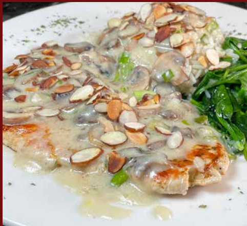
Chicken Almondine Boneless Skinless Chicken Breast Sautéed with Fresh Mushrooms Green Onions Garlic Lemon Butter Wine Sauce and topped with Toasted Almond Slices 18.95