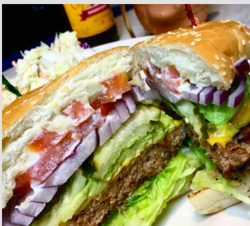
California Turkey Burger Ground Turkey topped with Avocado and Cheese 14.95 Turkey Burger 13.25