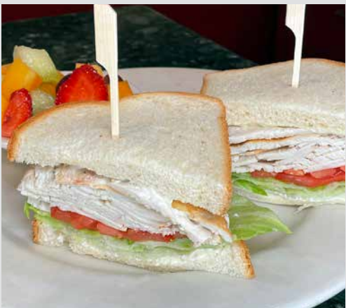
Classic Turkey Fresh Sliced Turkey Served with Lettuce and Tomato 12.25