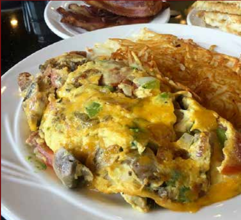
The Kitchen Sink Peppers, Ground Beef or Turkey, Onions, Bacon, Italian Sausage, Linguica, Mushrooms, Tomatoes, Spinach, Avocado, Cheddar and Jack Cheese 17.75