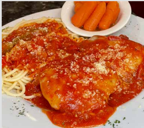
Chicken Parmigiana Freshly Cubed and Breaded (8oz) Chicken Breast Smothered with Elio's Homemade Marinara Sauce and topped with Melted Parmesan Cheese 18.50