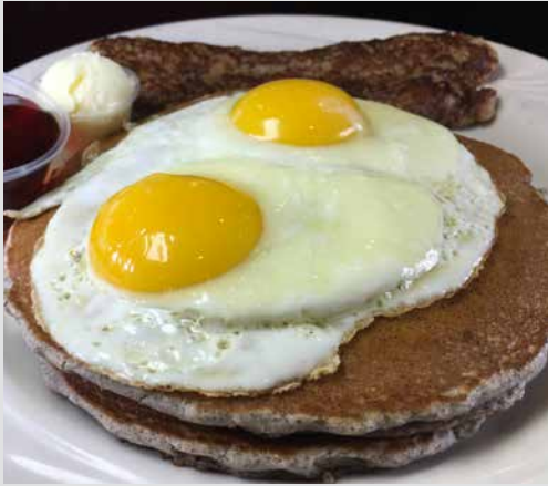
The Slam Two Eggs, Two Bacon, Two Link Sausage and Two Pancakes 14.95

Served with Choice of Hash Browns, Home Fries or Cup of Fruit. All Omelets come with Toast