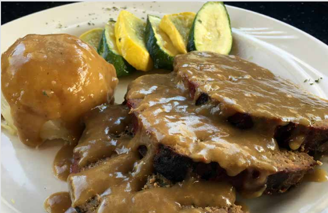
Monday Baked Meatloaf And Gravy 18.75

All Dinners Include Choice of Soup or Salad. 2nd Choice: Rice, Spaghetti, Baked Potato, Fries or Cup of Fruit. All items Served with Vegetables. (Taco Salad Excluded. Corn Beef Cabbage Served With Soup Or Salad Only)