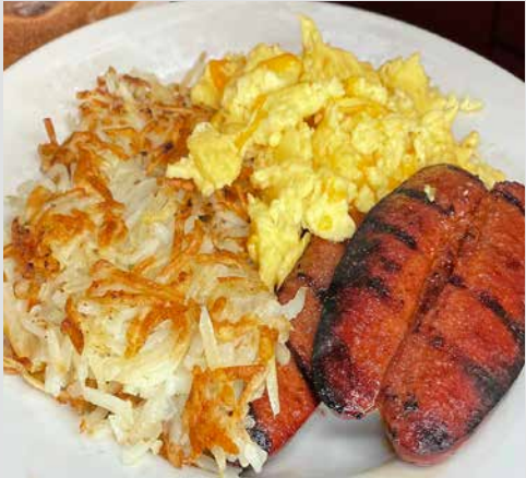
Hot Links And Eggs Served with 2 Eggs any style and your Choice of Hash Browns, Home Fries or Cup of Fruit comes with Choice of Toast 15.50