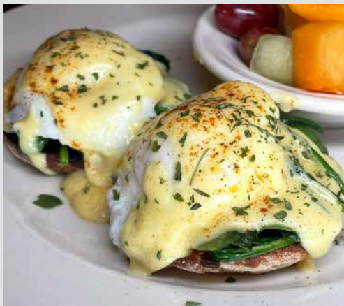
Eggs Florentine with Spinach 14.95