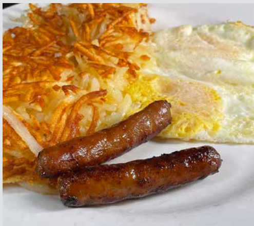
Special #1 2 Eggs, Two Strips of Bacon or Two Link Sausages 14.50

Add 6.75 Breakfast Ham Chicken Apple Sausage Corn Beef Hash Italian Sausage Linguica