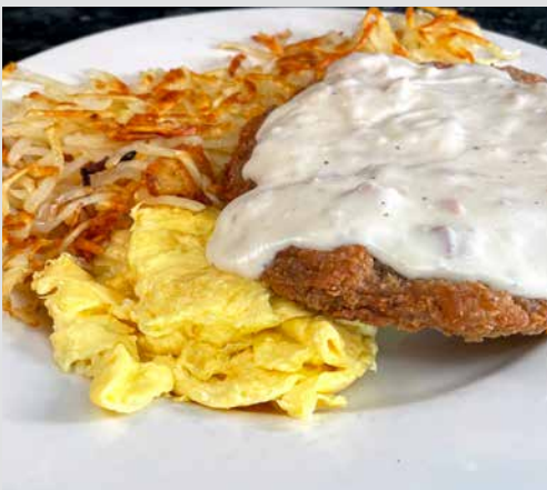
Chicken Fried Steak And Eggs Served with Country Gravy and Two Eggs Any Style 17.50