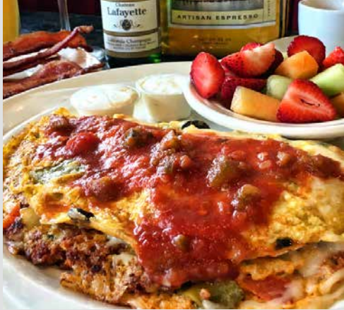
Chorizo Omelet Chorizo with Chopped Ortega Chilies, Tomatoes, Onion, Jack Cheese, Sliced Black Olives and Cheddar Cheese. Topped with Salsa and Sour Cream Served with Hash Browns, Home Fries or Cup of Fruit. Comes with Choice of Toast 15.95