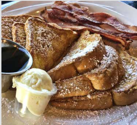
French Toast 4 Halves 9.25, 6 Halves 10.50