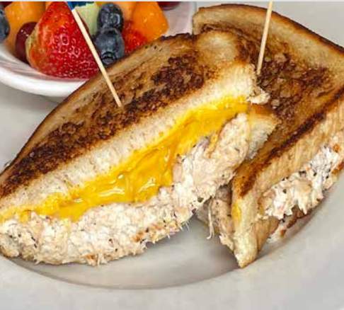
Tuna Melt Elio's own Tuna Salad Grilled with Melted with Cheddar Cheese 14.95