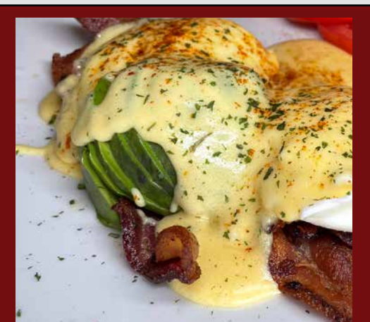
Keto Benedict Two Poached Eggs Served on Avocado, Bacon and Tomato. Comes Green Salad 14.95