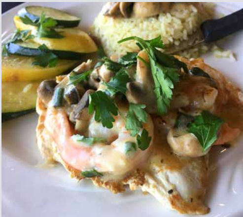
Chicken And Scampi Boneless (8oz) Chicken Breast and Tiger Shrimp Prawns Sautéed with Green Onions, Mushrooms, Fresh Garlic and Lemon Butter Wine Sauce 19.95