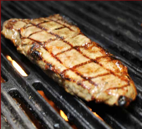
New York Steak (12oz) 28.95