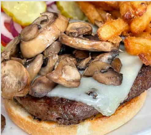
Mushroom And Swiss Burger 14.75