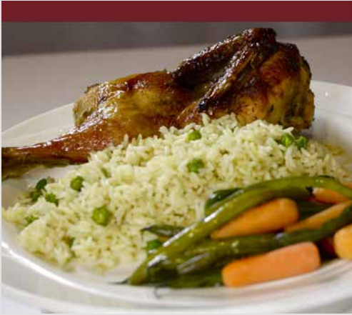
Greek Chicken Marinated Half Chicken in our Elios Special Seasoning and Roasted to Perfection 16.95