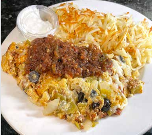
Santa Fe Chopped Ortega Chilies, Tomatoes, Onion, Jack Cheese, Sliced Black Olives, topped with Salsa and Sour Cream 15.75