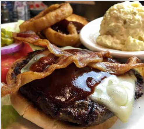
BBQ Burger Onion Rings, Swiss Cheese, BBQ Sauce and Bacon 15.95