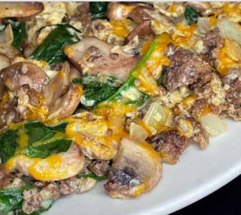
Joe’s Scramble Mushrooms, Ground Beef or Turkey, Spinach, Onions and Cheddar Cheese 15.95