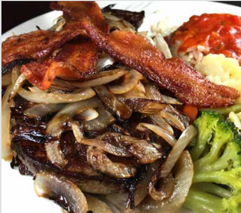
Fresh Beef Liver Fresh Beef Liver Served w/ Grilled Onions and Bacon 17.95

All Dinners Include Choice of Soup or Salad. 2nd Choice: Rice, Spaghetti, Baked Potato, Fries or Cup of Fruit. All items Served with Vegetables