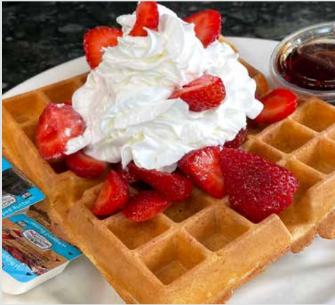
Belgian Waffle 11.50 Served Whipped Cream