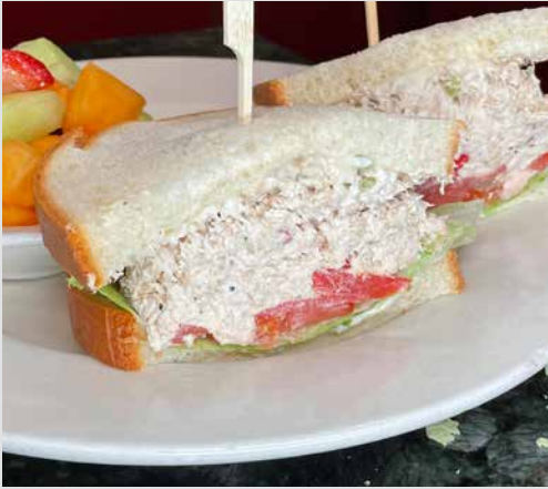
Tuna Sandwich Served with Lettuce and Tomato 12.95