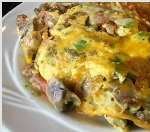
The Kitchen Sink keto Omelet Peppers, Ground Beef or Turkey, Onions, Bacon, Italian Sausage, Linguica, Mushrooms, Tomatoes, Spinach, Avocado, Cheddar and Jack Cheese. Comes with Sliced Tomatoes Instead of Starches 16.75