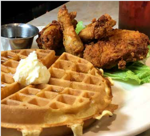
Chicken N Waffles 17.75