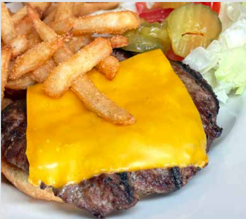
Cheese Burger Cheddar, Jack, American or Swiss 14.00

All Burgers Are 8oz 1/2lb USDA Choice Ground Chuck charbroiled to order. Served with Lettuce, Tomato, Pickle And Onions. With Choice of French Fries, Potato Salad, Green Salad, Cup of Soup, Fresh Fruit or Cole Slaw.