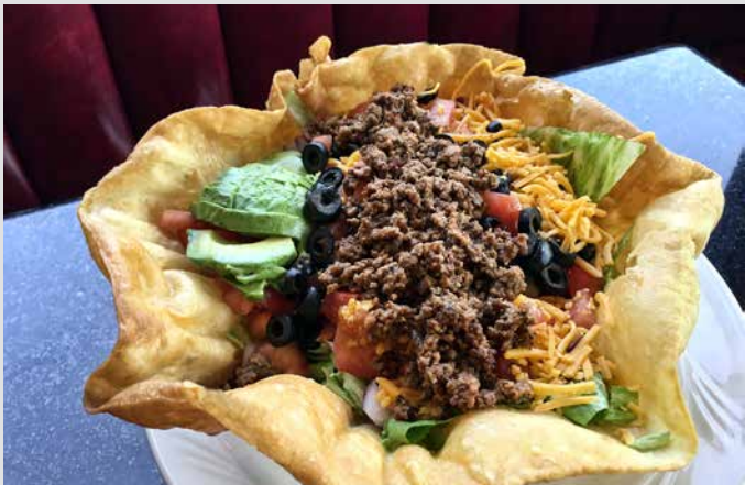
Tuesday Taco Salad Choice of Ground Beef, Steak or Chicken, Re fried Beans, Chopped Iceberg Lettuce Sour Cream, Guacamole, Red Onions, Salsa, Sliced Black Olives and Cheddar Cheese 18.50