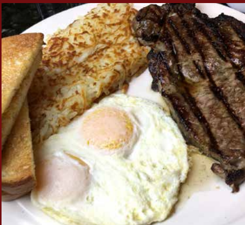
New York Steak And Eggs (8oz) New York Steak, 2 Eggs. Hash Browns or Cup of Fruit 21.95