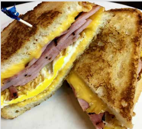
Ham, Egg And Cheese Grilled Ham and Egg Served on Grilled Sourdough 12.95