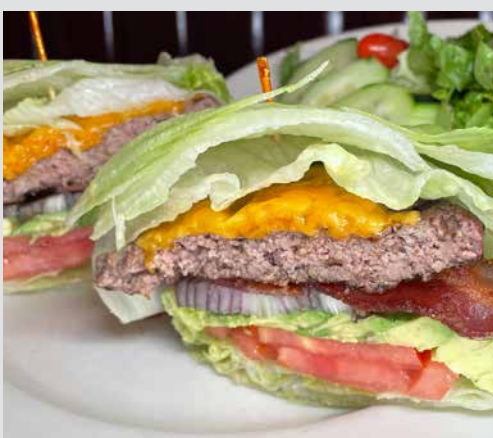
ABC Keto Burger Avocado, Bacon, and American Cheese Served in a Lettuce Wrap. Comes with a Green Salad 14.50