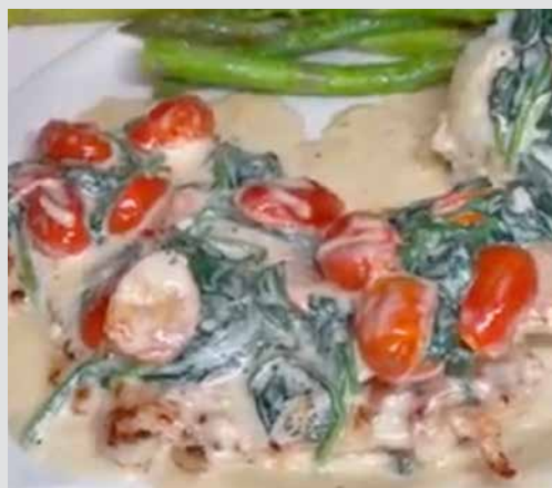
Chicken Florentine Grilled Chicken, Cherry Tomatoes and Spinach and White Sauce 18.75