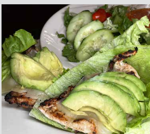
Chicken Keto Sandwich Broiled (8oz) Chicken Breast topped with Jack Cheese and Avocado Served on a Lettuce Wrap comes with a Green Salad 14.50