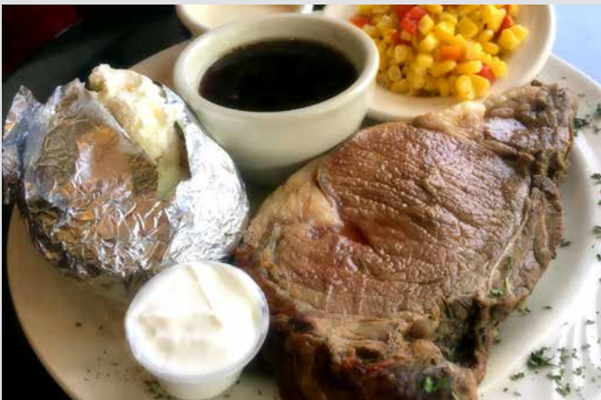
Friday And Saturday Prime Rib 33.95