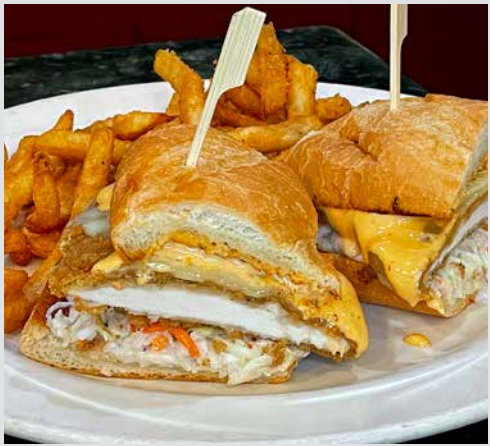
Crispy Chicken Sandwich House Breaded Chicken Breast fried topped Jack Cheese, Jalapeno Cole Slaw. Served on a French Roll 15.25