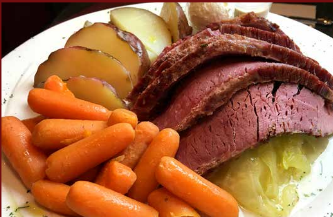
Thursday Corned Beef And Cabbage Served with Red Potatoes and Baby Carrots 17.95