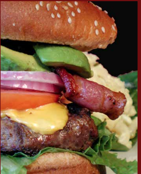
Chef's Burger (ABC) Avocado, Bacon, and American Cheese 15.95