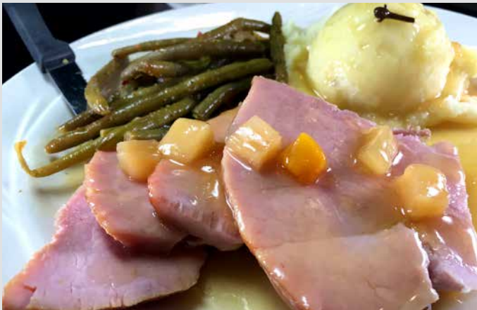
Sunday Glazed Baked Ham 18.50