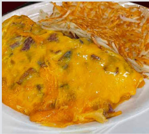
Bacon Omelet And Cheddar Cheese with Hash Browns, Home Fries or Cup of Fruit. Comes with Choice of Toast 15.50