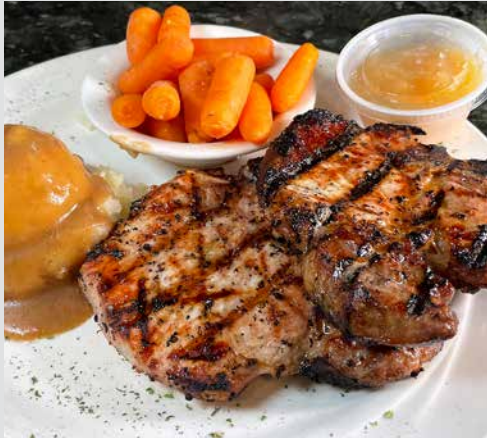
Broiled Pork Chops Two Thick Center Pork Chops Flame Broiled and Served with Apple Sauce 18.95