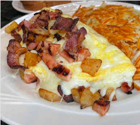
Hawaiian Ham, Bacon, Pineapple and Jack Cheese 15.95