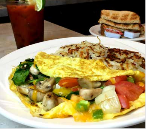
Vegetarian Spinach, Mushrooms, Tomatoes, Green Peppers, Onions and Cheddar Cheese 14.95