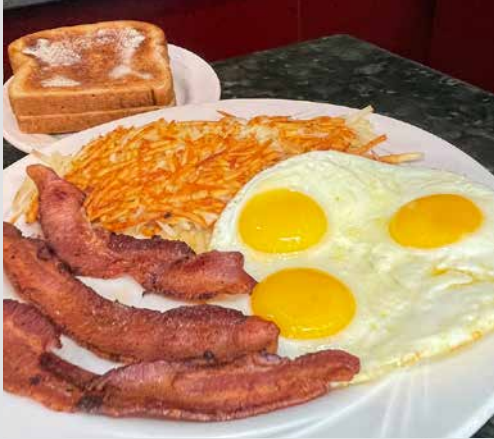
Early Bird Three Slices of Bacon Or Three Link Sausages and Three Eggs with Choice of Hash Browns, Home Fries or Cup of Fruit. Comes with Choice of Toast 14.95