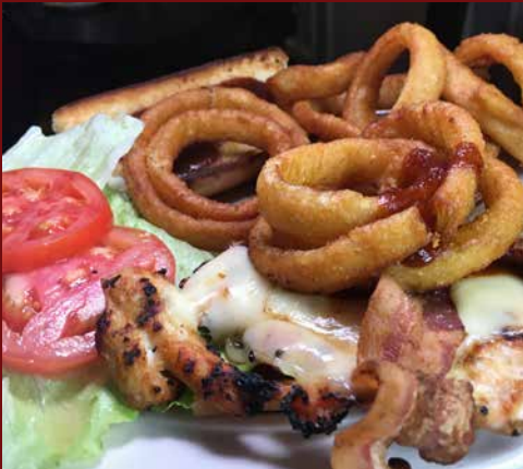
BBQ Chicken Broiled Chicken Breast. Topped with Onion Rings, Swiss Cheese, BBQ Sauce, and Bacon on a French Roll 16.50