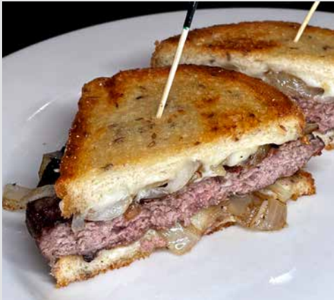
Patty Melt Cheddar Cheese and Grilled Onions on Rye Bread 14.75

Served with Lettuce, Tomato, Pickle And Onions. With Choice of French Fries, Potato Salad, Green Salad, Cup of Soup, Fresh Fruit or Cole Slaw.