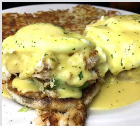
Crab Cake Benedict with Avocado 18.50