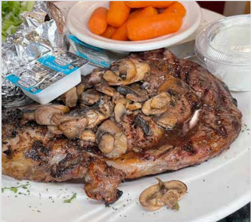
Rib Eye Steak (12oz) 29.95