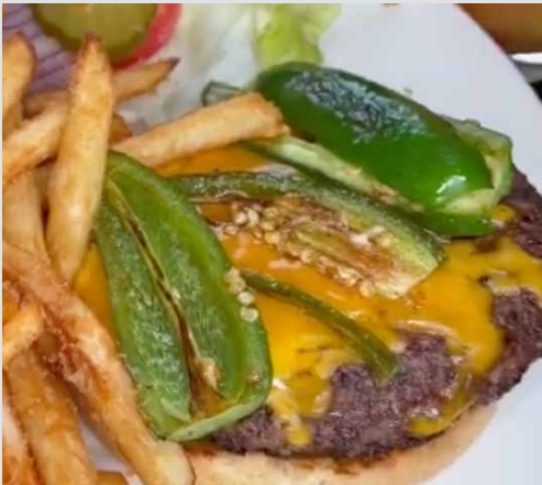
Jalapeno Burger Grilled Jalapenos, Avocado, Cheddar Cheese, Tomatoes, Onions and Iceberg Lettuce 15.00