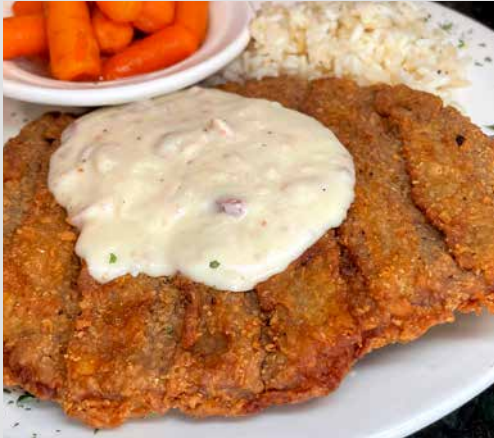
Chicken Fried "Beef Steak" Fresh Cubed Beef Served with Country Gravy 17.95