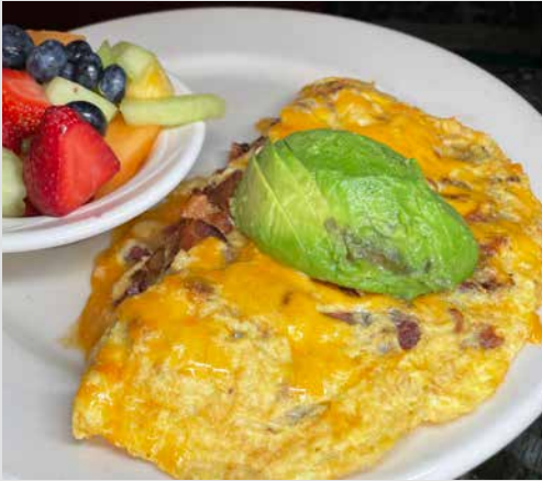
ABC Avocado, Bacon and Cheddar Cheese 15.95