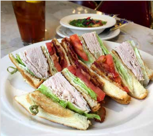
Club House Triple Decker Classic with Turkey, Bacon, Lettuce, Tomato and Mayo on any Toast 14.50