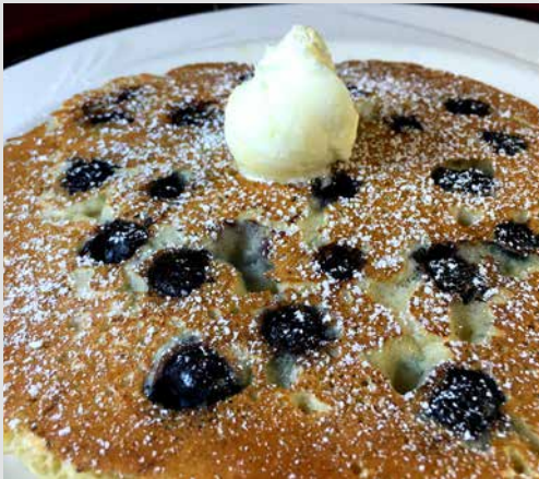
Blueberry Pancakes Stack of Two Served with Blueberries and topped with Whipped Cream 10.75