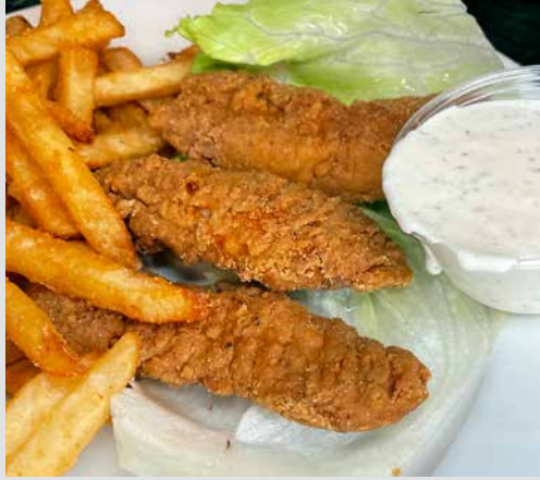
Chicken Strips (6pc) 15.50