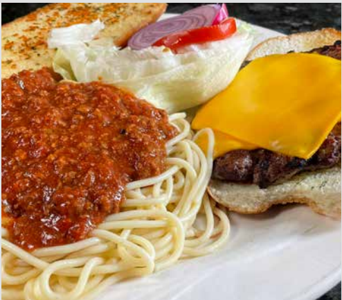
Italiano Burger Served on Garlic French Roll, American Cheese (Comes with Soup or Salad Served with Spaghetti only) 16.75