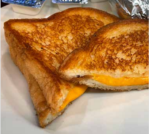
Grilled Cheese Cheddar, Jack or Swiss on any Bread 11.00 Add Deli Ham 2.50 extra