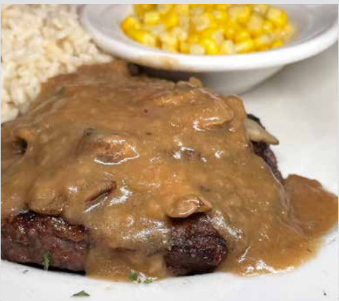
Ground Round Steak (8oz) 15.95