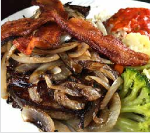
Fresh Beef Liver Fresh Beef Liver Served w/ Grilled Onions and Bacon 18.95

All Dinners Include Choice of Soup or Salad. 2nd Choice: Rice, Spaghetti, Baked Potato, Fries or Cup of Fruit. All items Served with Vegetables