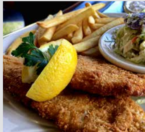
Petrale Sole Fried in Egg Batter or with Greek Lemon Sauce Served with Tartar Sauce 18.50