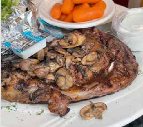
Rib Eye Steak (12oz) 30.95