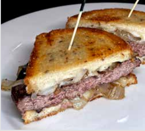
Patty Melt Cheddar Cheese and Grilled Onions on Rye Bread 15.00

Served with Lettuce, Tomato, Pickle And Onions. With Choice of French Fries, Potato Salad, Green Salad, Cup of Soup, Fresh Fruit or Cole Slaw.