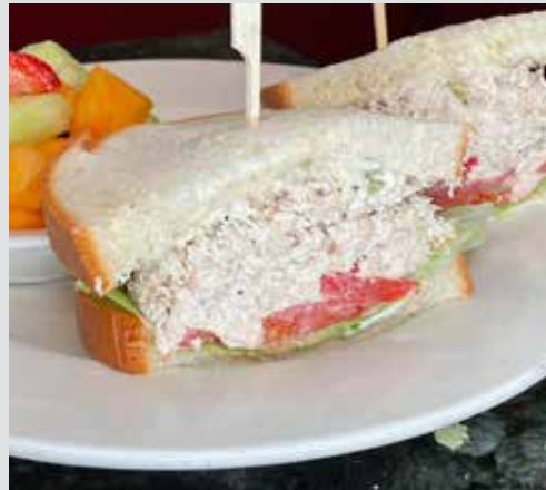
Tuna Sandwich Served with Lettuce and Tomato 13.50