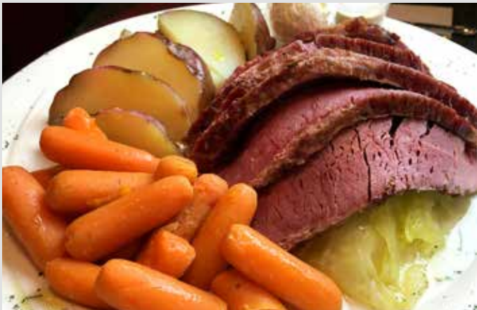
Thursday Corned Beef And Cabbage. Served with Red Potatoes and Baby Carrots 18.95