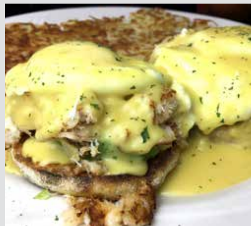
Crab Cake Benedict with Avocado 19.95