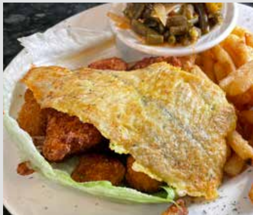
Elio's Fisherman's Platter Combo of 3 Golden Fried Jumbo Prawns, 6 Tender Scallops, and Filet of Sole 19.95

All Dinners Include Choice of Soup or Salad. 2nd Choice: Rice, Spaghetti, Baked Potato, Fries or Cup of Fruit. All items Served with Vegetables