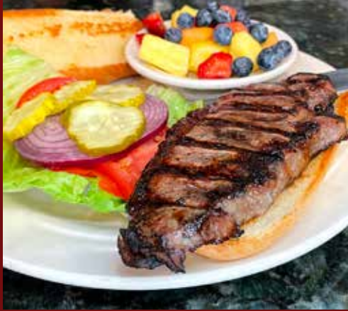
Steak Sandwich USDA Choice (8oz) New York Steak on a French Roll 19.95