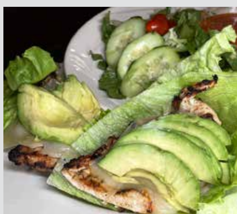
Chicken Keto Sandwich Broiled (8oz) Chicken Breast topped with Jack Cheese and Avocado Served on a Lettuce Wrap comes with a Green Salad 15.00