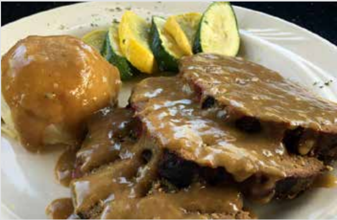
Monday Baked Meatloaf And Gravy 18.95

All Dinners Include Choice of Soup or Salad. 2nd Choice: Rice, Spaghetti, Baked Potato, Fries or Cup of Fruit. All items Served with Vegetables. (Taco Salad Excluded. Corn Beef Cabbage Served With Soup Or Salad Only)