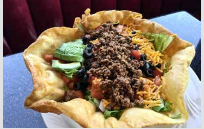
Tuesday - Taco Salad Choice of Ground Beef, Steak or Chicken, Re fried Beans, Chopped Iceberg Lettuce Sour Cream, Guacamole, Red Onions, Salsa, Sliced Black Olives and Cheddar Cheese 18.95