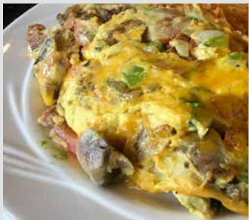
The Kitchen Sink keto Omelet Peppers, Ground Beef or Turkey, Onions, Bacon, Italian Sausage, Linguica, Mushrooms, Tomatoes, Spinach, Avocado, Cheddar and Jack Cheese. Comes with Sliced Tomatoes Instead of Starches 17.75