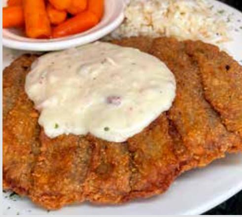
Chicken Fried "Beef Steak" Fresh Cubed Beef Served with Country Gravy 18.95