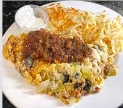
Santa Fe Chopped Ortega Chilies, Tomatoes, Onion, Jack Cheese, Sliced Black Olives, topped with Salsa and Sour Cream 16.50