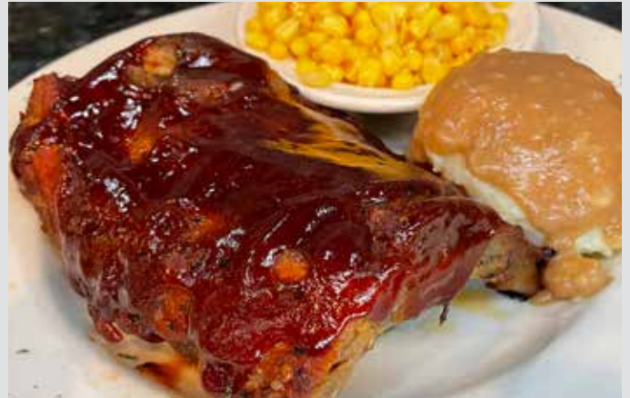
Friday Spare Ribs 20.50