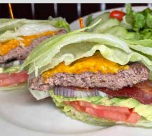
ABC Keto Burger Avocado, Bacon, and American Cheese Served in a Lettuce Wrap. Comes with a Green Salad 15.00