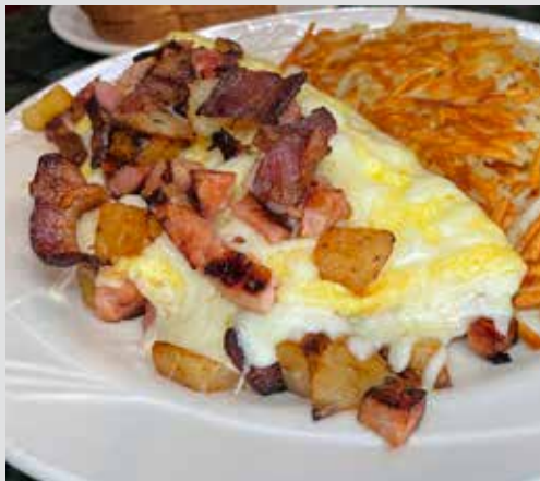
Hawaiian Ham, Bacon, Pineapple and Jack Cheese 16.50