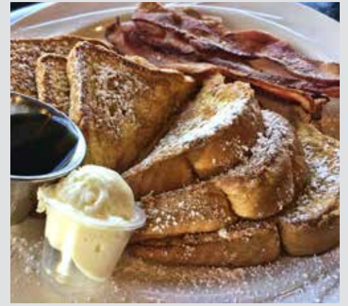
French Toast 4 Halves 9.50 6 Halves 10.75