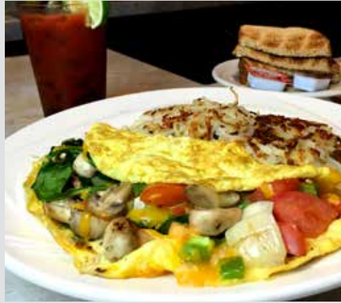
Vegetarian Spinach, Mushrooms, Tomatoes, Green Peppers, Onions and Cheddar Cheese 15.50