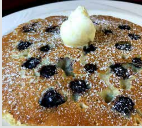
Blueberry Pancakes Stack of Two Served with Blueberries and topped with Whipped Cream 10.95