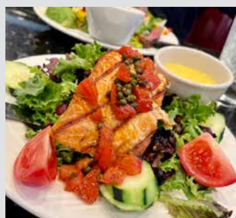
Salmon Salad Broiled Salmon (10oz) Served on a bed of Spring Mix Greens, Cucumbers, Grapes and Cranberries topped with Tomatoes, Capers and Honey Mandarin Dressing 21.95