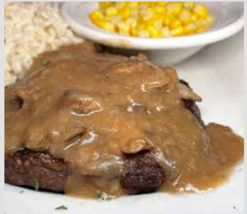
Ground Round Steak (8oz) 16.95