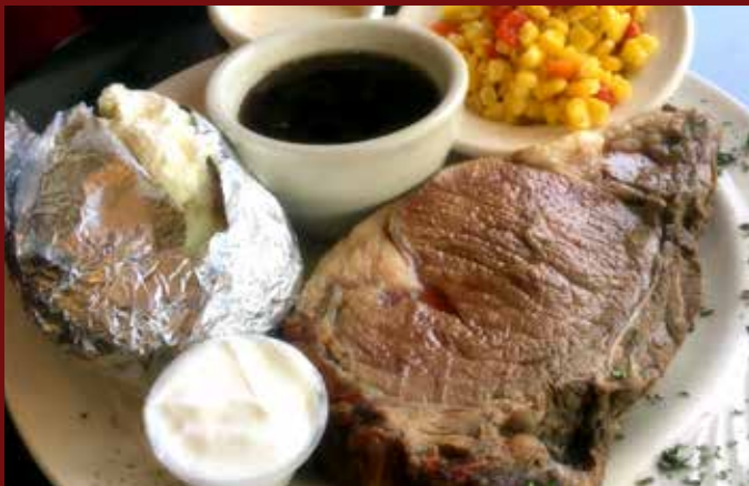
Saturdays Prime Rib 34.95