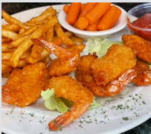
Fried Jumbo Prawns (6pc) 18.95