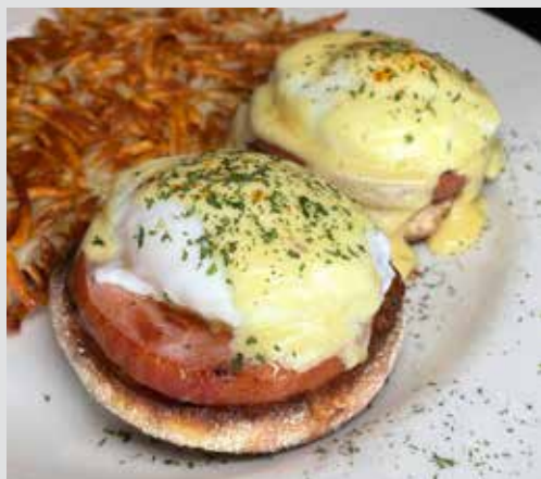
Eggs Benedict with Canadian Bacon 16.50

Served with 2 Poached Eggs And Hollandaise Sauce on an English Muffin only with Hash Browns, Home Fries or Cup Fruit.