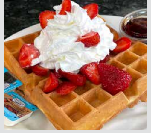
Belgian Waffle 11.50 Served Whipped Cream