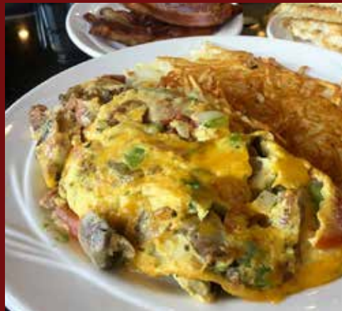
The Kitchen Sink Peppers, Ground Beef or Turkey, Onions, Bacon, Italian Sausage, Linguica, Mushrooms, Tomatoes, Spinach, Avocado, Cheddar and Jack Cheese 18.95