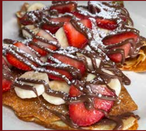
Nutella Crepes Thin French- Style Pancake filled with Sweetened Hazelnut Cocoa Nutella Spread topped with Fresh Straberries, Bannas, Whipped Cream and Nutella Drisseled on Top 14.95