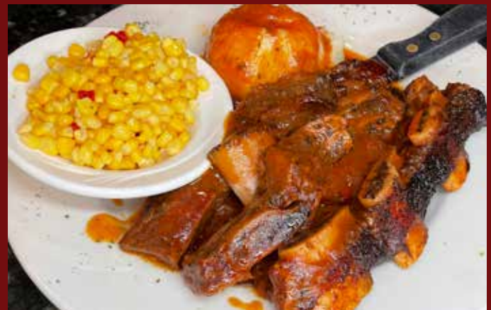
Saturdays Short Ribs 34.95