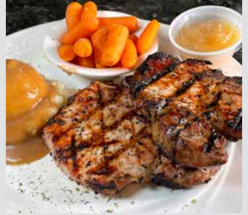
Broiled Pork Chops Two Thick Center Pork Chops Flame Broiled and Served with Apple Sauce 19.95