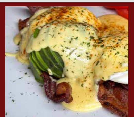
Keto Benedict Two Poached Eggs Served on Avocado, Bacon and Tomato. Comes Green Salad 15.50