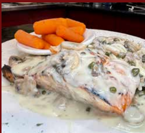
Salmon Piccata Broiled Salmon Sautéed with Fresh Mushrooms, Green Onions, Garlic, Lemon Butter Wine Sauce and Capers 23.95