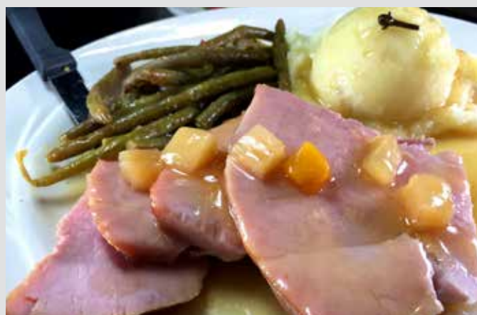
Sunday Glazed Baked Ham 18.95