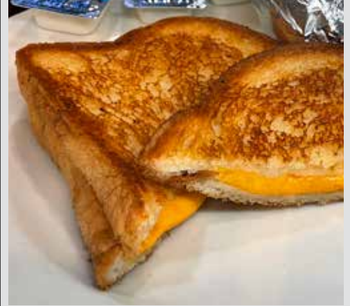
Grilled Cheese Cheddar, Jack or Swiss on any Bread 11.00 Add Deli Ham 3.00 extra