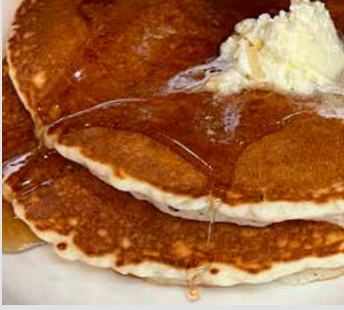
Buttermilk Pancakes Stack of Two 9.75