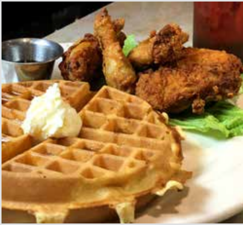
Chicken N Waffles 17.95