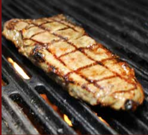
New York Steak (12oz) 29.95