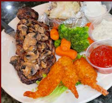
New York Steak Prawns (12oz) 3 Jumbo Prawns 30.95