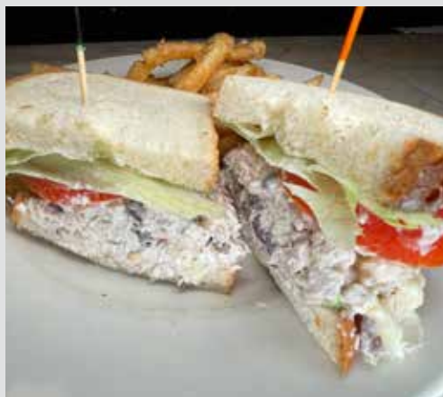
Chicken Salad Made with chopped apples, WALNUTS , grapes, red onions and dried cranberries on white bread. 14.50