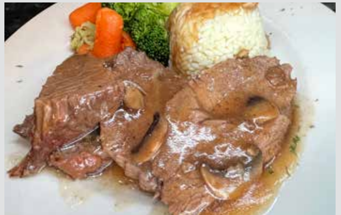
Thursday Greek Pot Roast 19.50