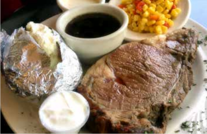
Friday Prime Rib 34.95

All Dinners Include Choice of Soup or Salad. 2nd Choice: Rice, Spaghetti, Baked Potato, Fries or Cup of Fruit. All items Served with Vegetables. (Taco Salad Excluded. Corn Beef Cabbage Served With Soup Or Salad Only)