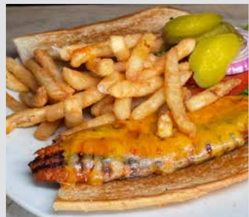
Linguica and Cheddar Cheese 15.50