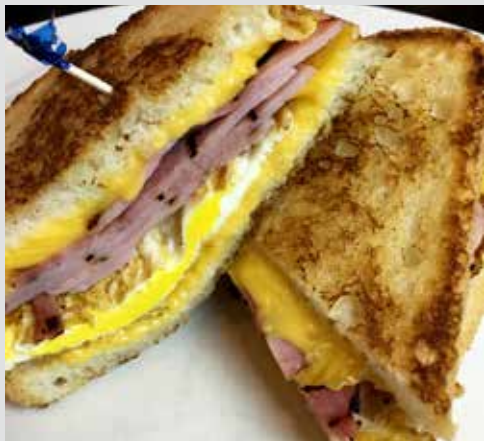
Ham, Egg And Cheese Grilled Ham and Egg Served on Grilled Sourdough 13.95