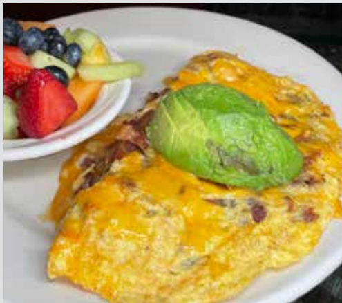
ABC Avocado, Bacon and Cheddar Cheese 16.50