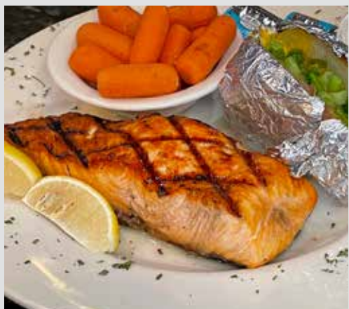
Broiled Salmon 22.95