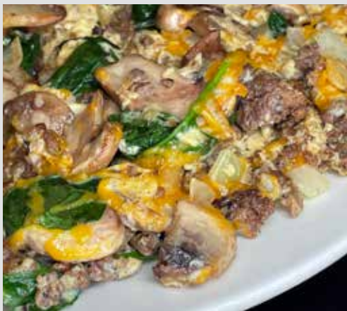
Joe's Scramble Mushrooms, Ground Beef or Turkey, Spinach, Onions and Cheddar Cheese 16.95