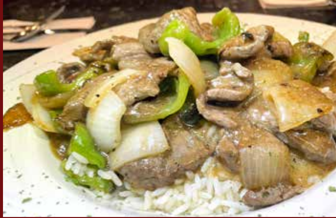
Wednesday Elios Pepper Steak Sauteed Bell Pepper and Onions in Elios Sauce. Served over a Bed of Rice 19.50