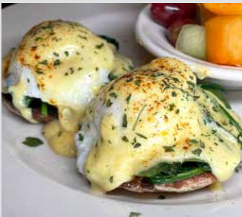
Eggs Florentine with Spinach 15.75