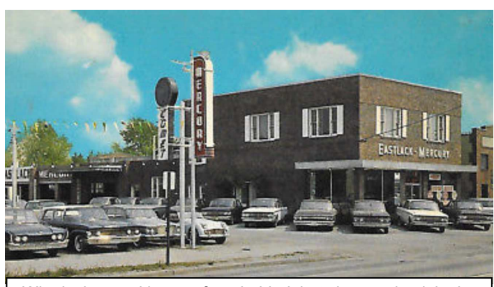
What's that peeking out from behind that signpost back in the day?? And where is she now? What do you think? '64-ish?