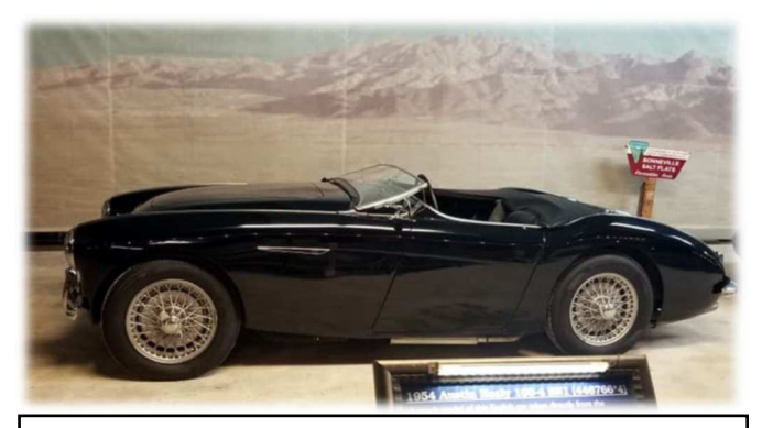
1954 Austin Healey 100-4 Salt Flats speed record car

The cars featured in this particular episode were the 1936 Bugatti Type 57 "Tank," and the 1964 Shelby Cobra Daytona Coupe. Both cars have a rather interesting history as they were once world record holders who were lost to the public for decades. The show documents their disappearance and return to prominence. The episode also features an interview with Dr. Fred Simeone, who now owns both of these significant cars. I was very surprised to see this show on tv only a couple of weeks after visiting the museum.