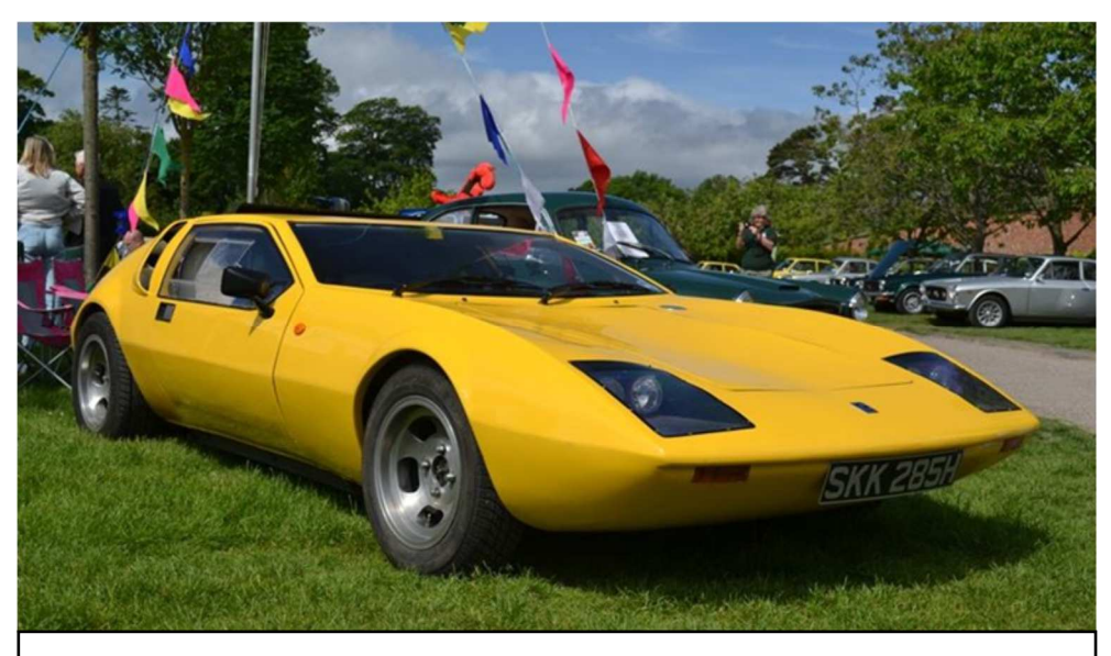
The T11 finished car built from the original prototype shell