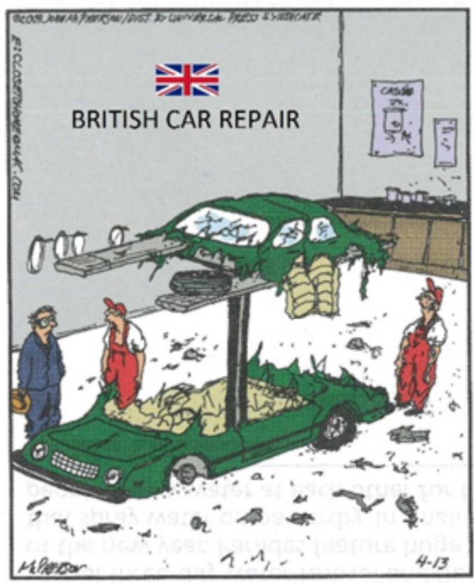
"The rust problem turned out to be more extensive than we expected."

It's a sad day around our house. Well sad for me, I don't know if anyone else is as affected by the incident as me. It was bound to happen, time goes on, things get old, worn out and tired. It had to happen someday but I didn't expect it this soon. It was a mere child, young, cut down in its prime. It still had another 50,000 miles left in it. Didn't it? Our '97 Discovery had to be hauled away to be "recycled," too much rust. The passenger floor pan had already been replaced and the driver's side and load space were due. When the brake lines fractured from rust, well, that was the end. We had a good run, say "hello" to any friends in Land Rover Heaven, via Allied Recycling, and wish them well...... we will have to soldier on in our new Volvo XC60. (sigh) sacrifices need to be made. ( thanks to "Close to Home" for the cartoon ).