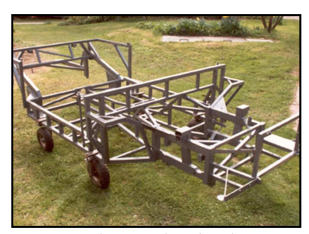
A bare Invader Mk II chassis