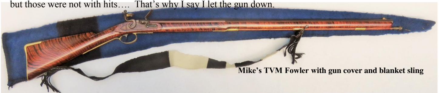
Mike's TVM Fowler with gun cover and blanket sling

David Little breaking another flying clay experience," was doing just fine while we were on the trail where we did our first shooting. After firing those shots, the flint was changed so a sharper flint would perhaps give more positive ignition for the paper match and the flier. That worked, at least in part, for the paper target match and for most of the fliers. But then the flint's edge was well rounded and knapping it only produced a more rounded edge. That made no sparks at all and this child was out of flints... An older used flint was found in the pouch so I was able to complete my shots but those were not with hits.... That's why I say I let the gun down.