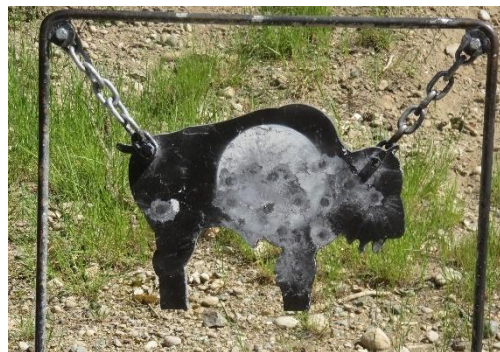
Target #1, the buffalo at 200- yards