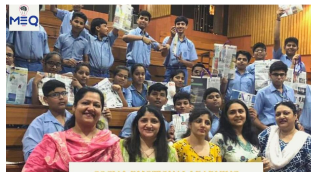
SOCIAL EMOTIONAL LEARNING

Connect with us for more information about 'SEL program for Schools'.