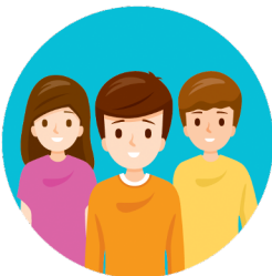
Avoid many people