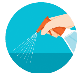
Clean and disinfect