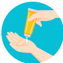
Use alcohol-based hand sanitizer