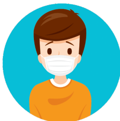
Wear a surgical mask if you are sick