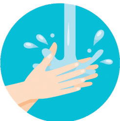
Wash your hands often