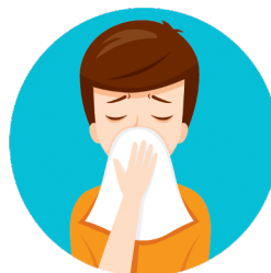
Cover coughs and sneezes