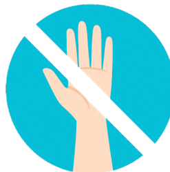
Avoid touching your face with unwashed hands