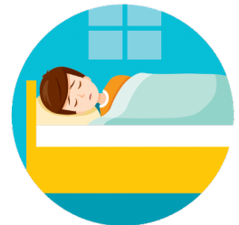
Stay home if you're sick