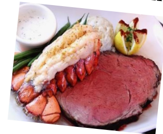
Award Winning Culinary Team