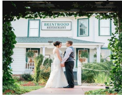
Gazebo Ceremony site