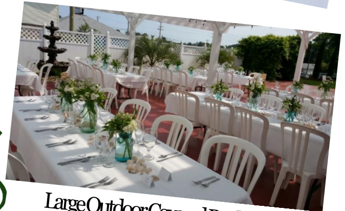
Large Outdoor Covered Pavilion