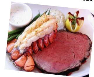
Award Winning Culinary Team