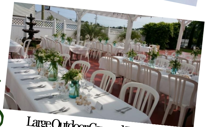
Large Outdoor Covered Pavilion