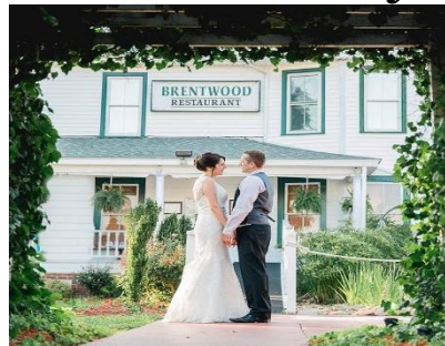
Gazebo Ceremony site