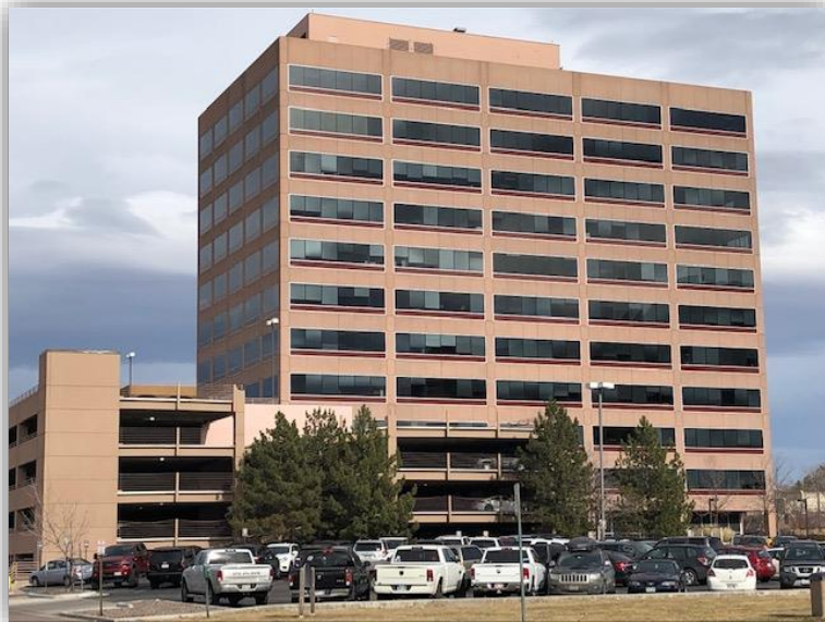
One Cherry Center Building

PLAN . START . IMPROVE . GROW RESTAURANT CONSULTING SERVICES® WWW.RESTAURANTCONSULTINGSERVICES.COM