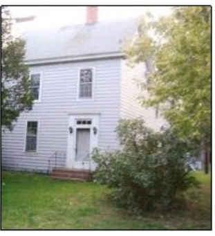
Huffington-Pollitt House, 1884-85 Our future home

Gifts to help us complete the restoration of the house's interior are gratefully received. You may make a gift in memory of a loved one or to honor a living person. We are a 501C-3 organization.