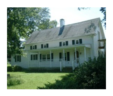
Passerdyke Cottage, c. 1830 Home of our Museum