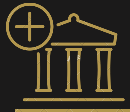
0 Balance account, CC, Loan (HDFC, ICICI, IndusInd, Kotak)