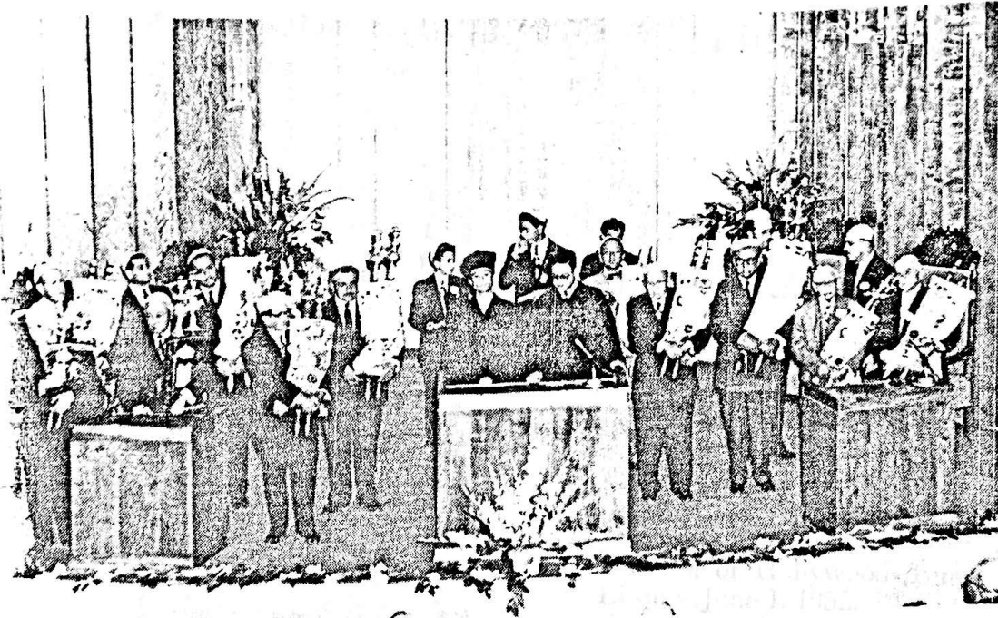
Scrolls of Torah brought into the New Sanctuary by the elders of Hollywood Temple Beth El.