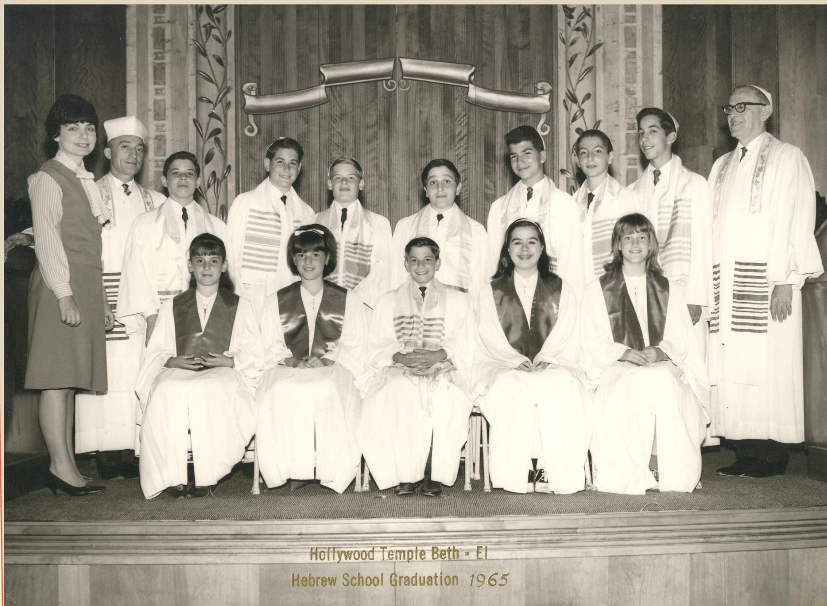
Hollywood Temple Beth - El Hebrew School Graduation 1965