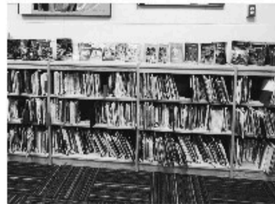
Left: 1st & 2nd Grade students visited Insectropolis in Toms River Right: RPS's Library received 54 new books for its collection.