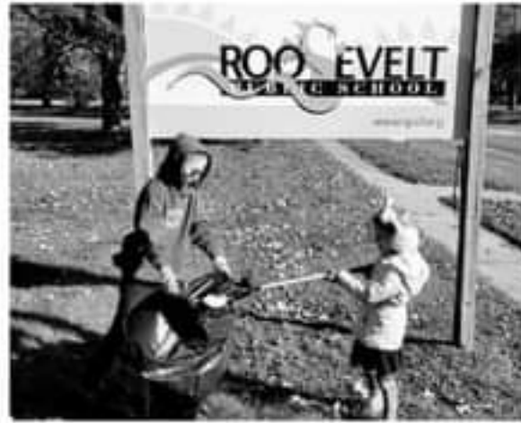
Above: RPSEF participated in Monmouth County's Clean Communities Fall Clean-Up.