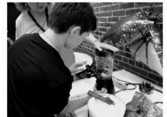
Left: An extended Pollinator Garden with new plantings. Right: New cooking supplies to make delicious smoothies.