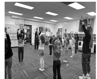
Students learn Tai Chi, the ancient art of deliberate flowing motions in the first VAP of the school year.