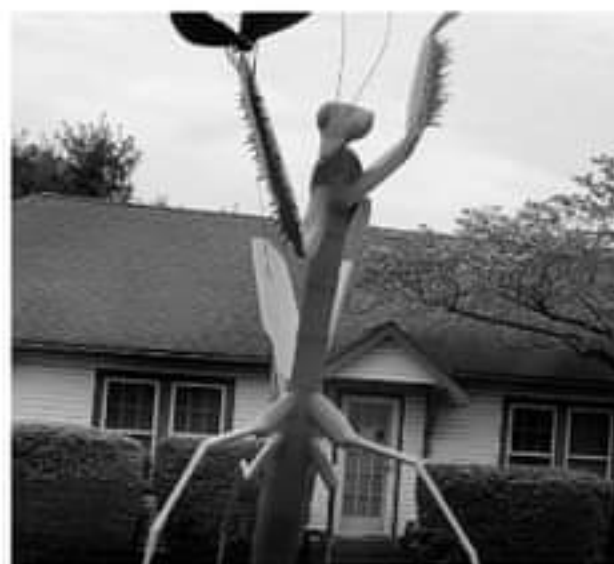
Below: A praying mantis statue welcomed grades K & 1 to their Insectropolis field trip in April.