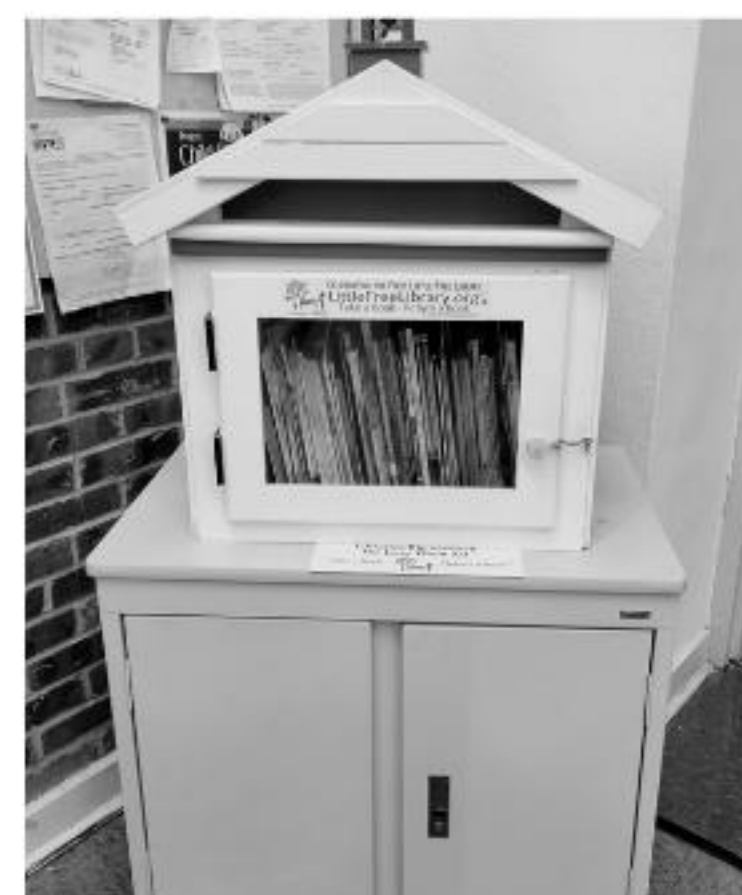
The Little Free Library is open to all students.

The Little Free Library at RPS is located in the RPS lobby. Students may pick a book to enjoy at home, bring a book to trade and share with others, or return completed books. The library is open to all students grades Pre-K through 5th. Come explore its collection!