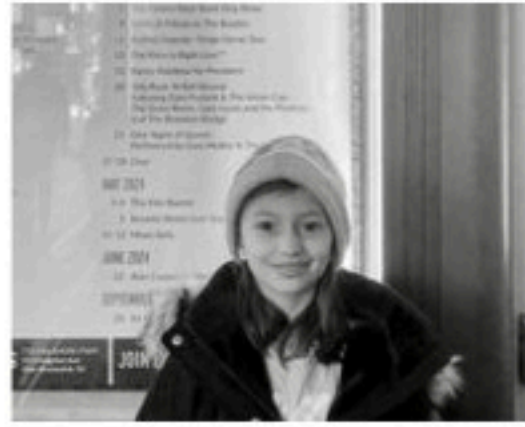
Left: Fish Tank at Jenkinson's Aquarium, Point Pleasant. Right: "The Boy Who Cried Wolf" at State Theater NJ, New Brunswick.