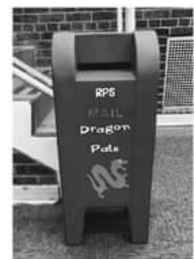
Right: RPS Dragon Pals letter writing program is underway. The mailbox is located in the school lobby.