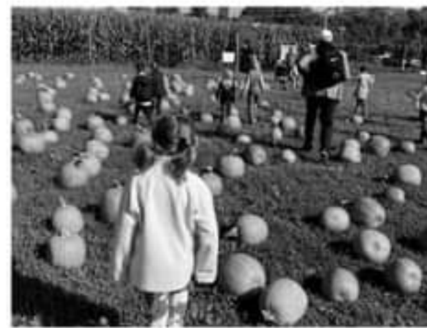
Above: Students in grades K & 1st attended a field trip to Terhune Orchards, Princeton NJ