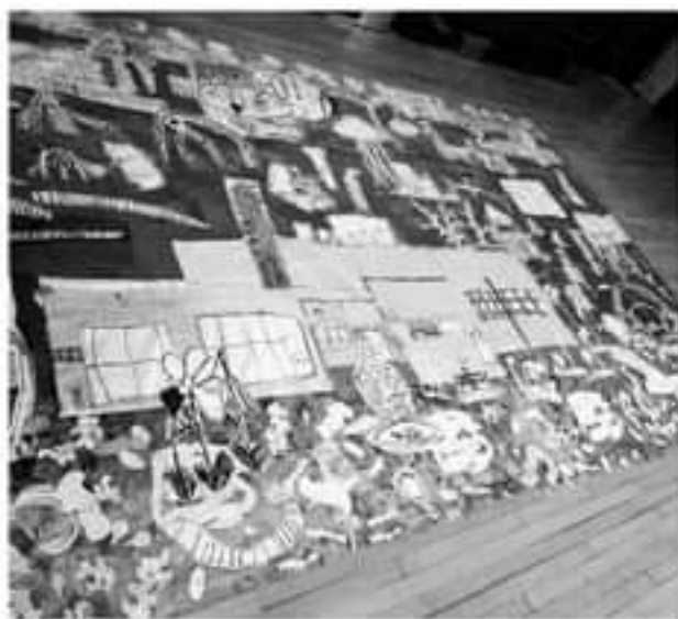
Above: During March's Visiting Artist Series, students created a mural representing RPS.

The Foundation looks forward to planning more fundraising events for the 2023-2024 academic year. Donations can be made any time by visiting our website www.rpsef.org . We remain committed to our mission in providing academic opportunities for RPS students in the 2023-2024 school year. Have a safe and restful summer break!