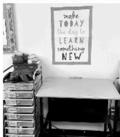
Above: Flexible seating allows for various learning setting options.