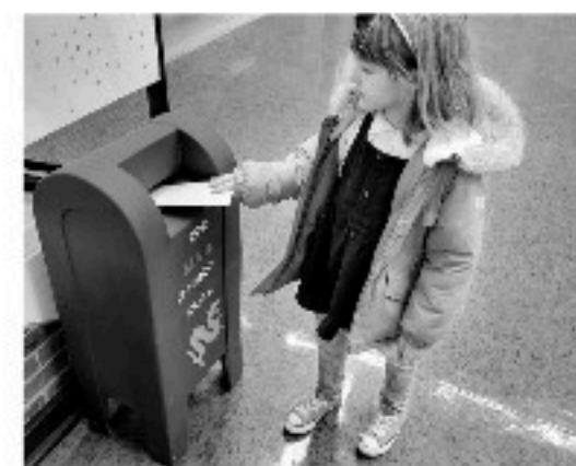
Above: Little Free Library Above: RPS Dragon Pals Mail