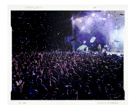
LIVE ARTIST PERFORMANCE