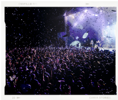
LIVE ARTIST PERFORMANCE