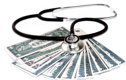
My Healthcare Cost

www.hearingbusinesses.com · Medicare Agent