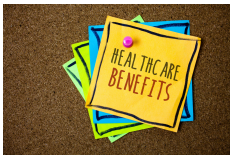
My Free Benefits