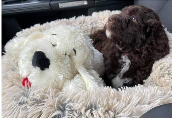
One of our puppies going home with their Snuggle Puppy!