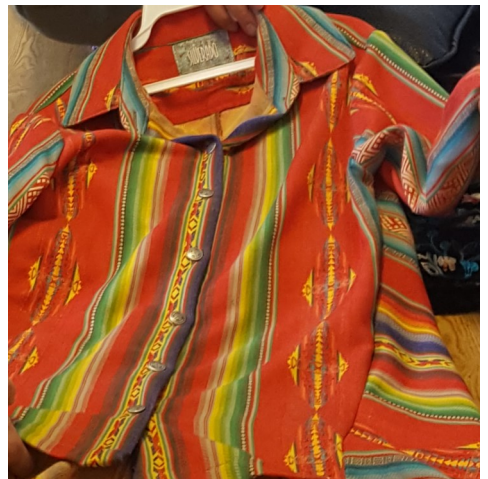
One of the many vibrant fabrics used to create unique clothing items.