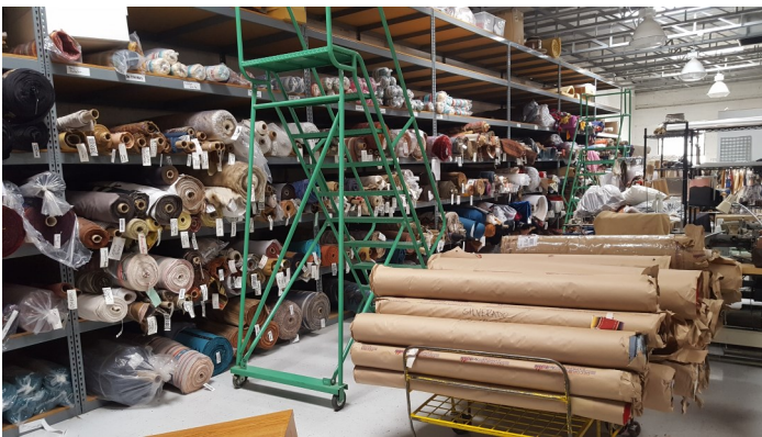
Rolls of fabric line an entire wall; each is given a catchy name like Canyon Lands, Trailblazer, Abbey Road or “de colores.”