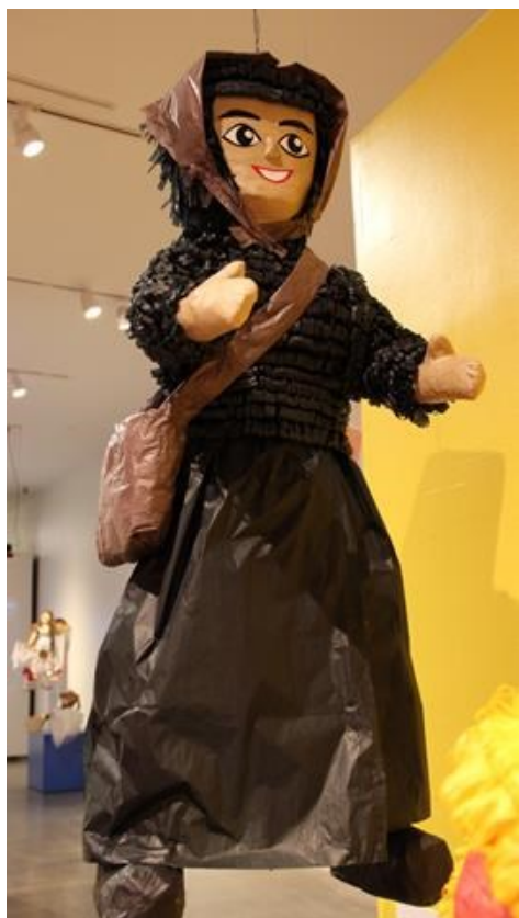
Bless Me Ultima Piñata

Be sure to catch this exhibit at the National Hispanic Cultural Center. The exhibit runs from June 23, 2017 to March 31, 2018 at the NHCC Museum.