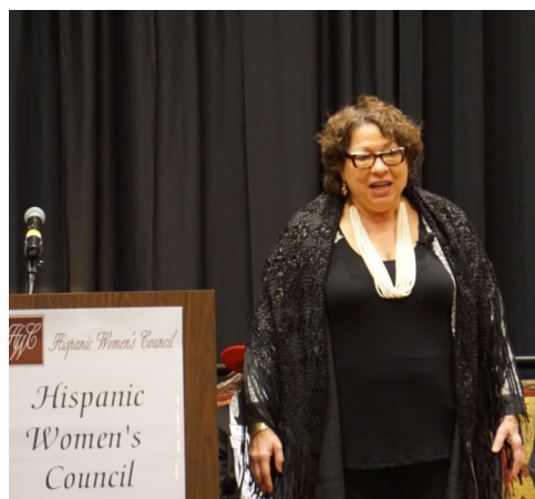
Supreme Court Justice Sonia Sotomayor

On April 5, 2016, HWC was honored to host Supreme Court Justice Sonia Sotomayor . She met with the HWC board of directors, then greeted a room-full of HWC members one-on-one. Finally, she delivered an inspiring message to over 600 guests who attended the public event. A detailed account of her visit is captured in a special edition of the HWC newsletter (posted on our website).