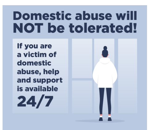
In an emergency: always call 999 If you can't speak, call 999 and dial 55. In a non-emergency: Call 101 or make a report online on our website.

We would also love to build a display of the children reading. Please email a picture of your children reading their favourite book to greenwood@weycp.org.uk