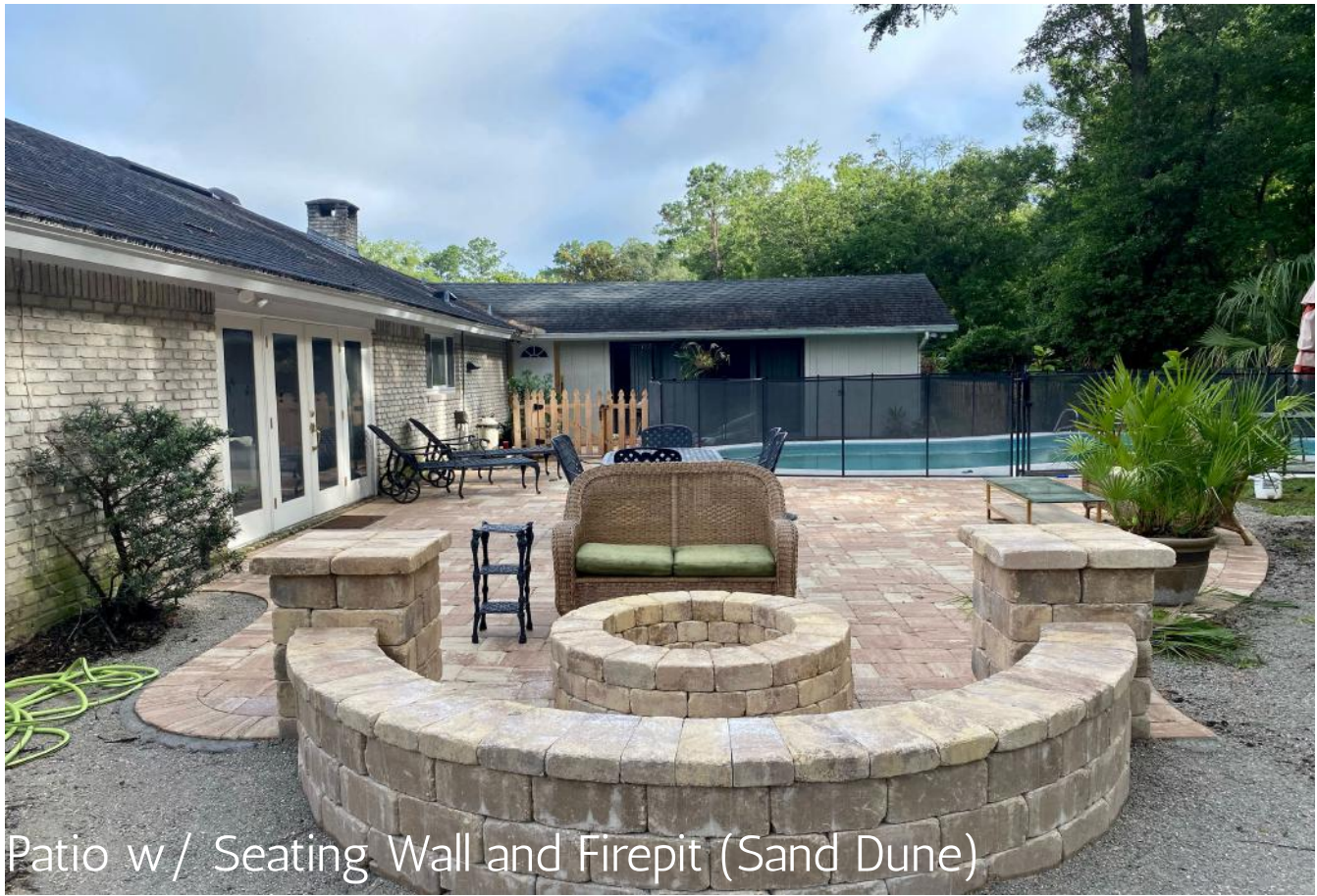
Patio w/ Seating Wall and Firepit (Sand Dune)