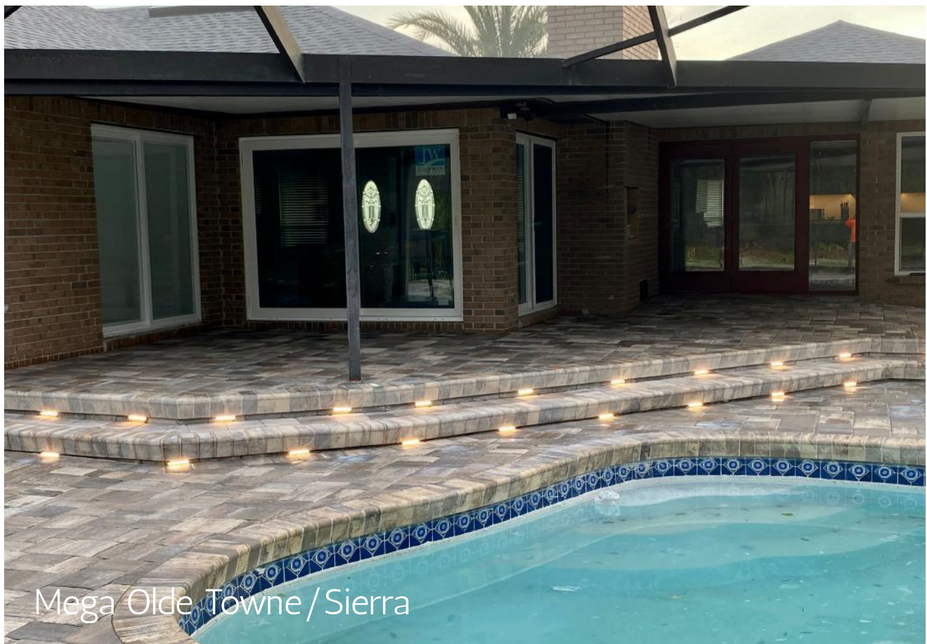
Mega Olde Towne / Sierra