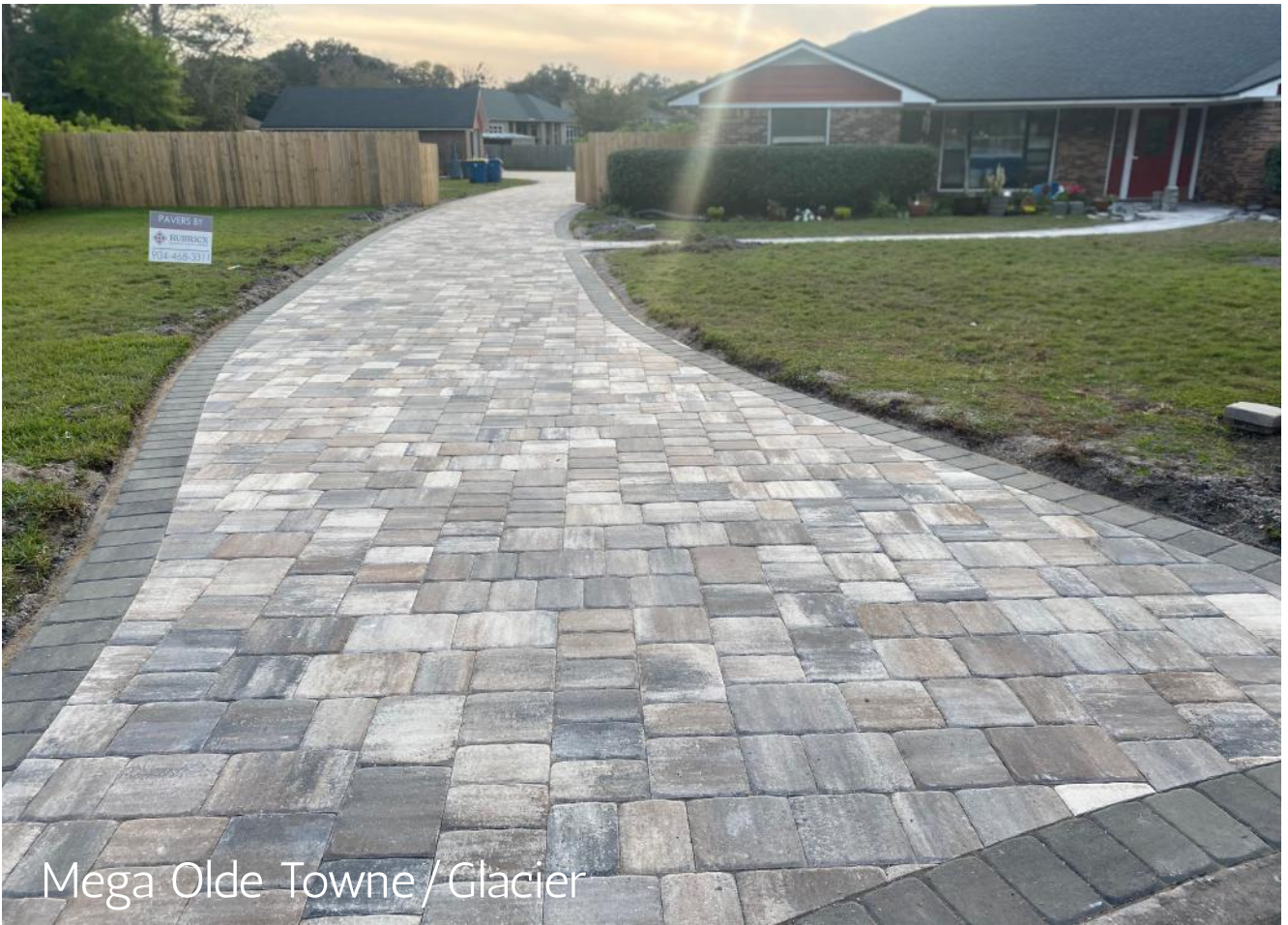
Mega Olde Towne / Glacier