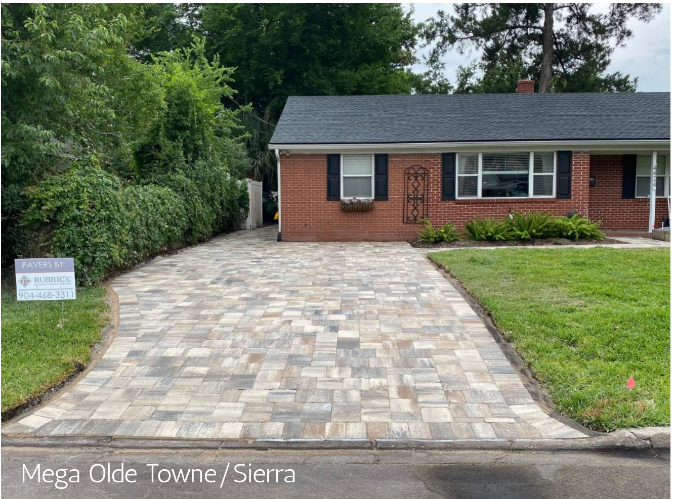
Mega Olde Towne / Sierra