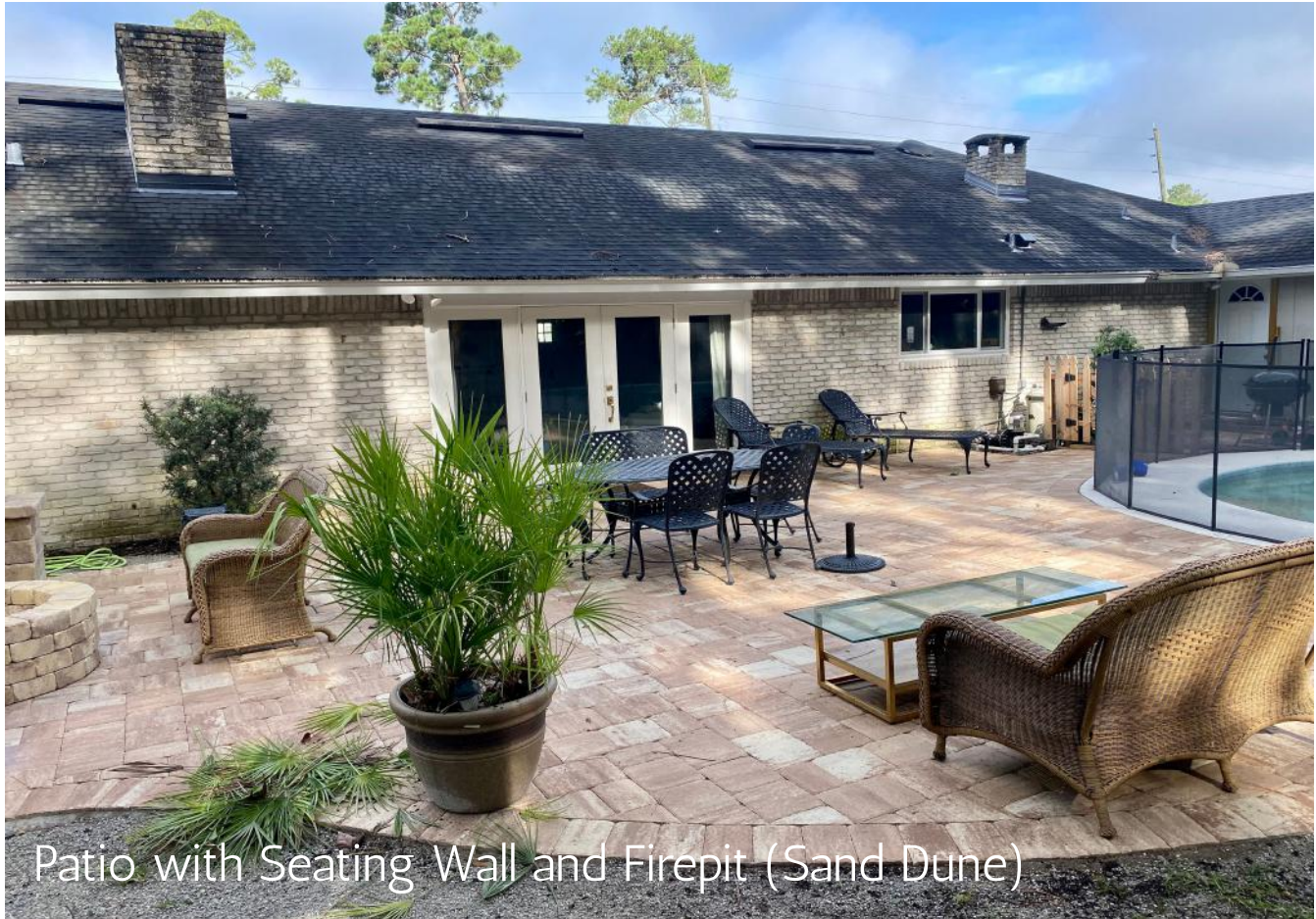
Patio with Seating Wall and Firepit (Sand Dune)