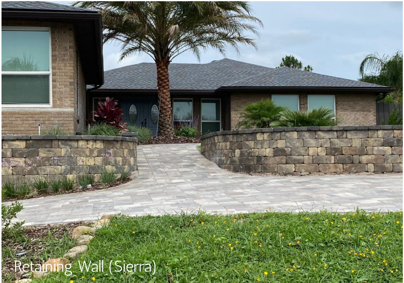
Retaining Wall (Sierra)