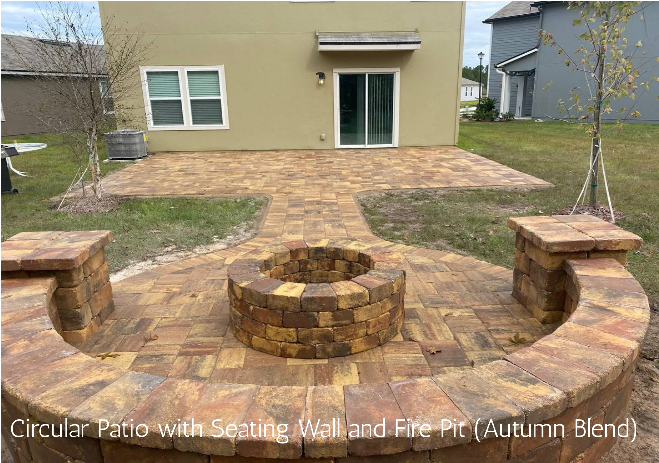
Circular Patio with Seating Wall and Fire Pit (Autumn Blend)