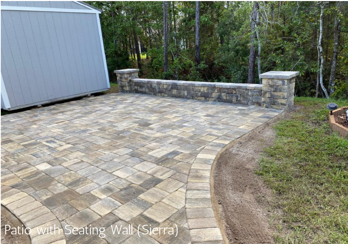
Patio with Seating Wall (Sierra)