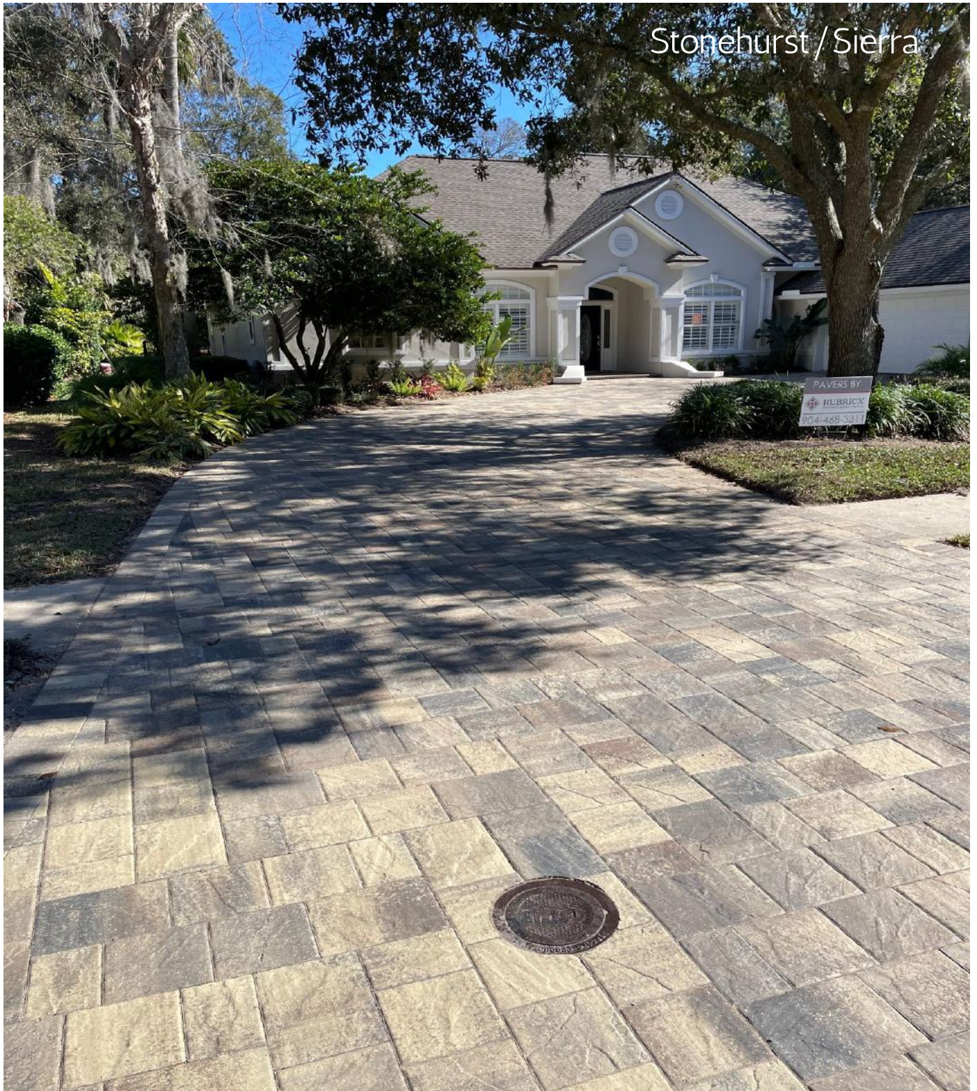
Stonehurst / Sierra

Accent your home with a paver driveway for major curb appeal. Add charm and personality while also increasing the value of your home!