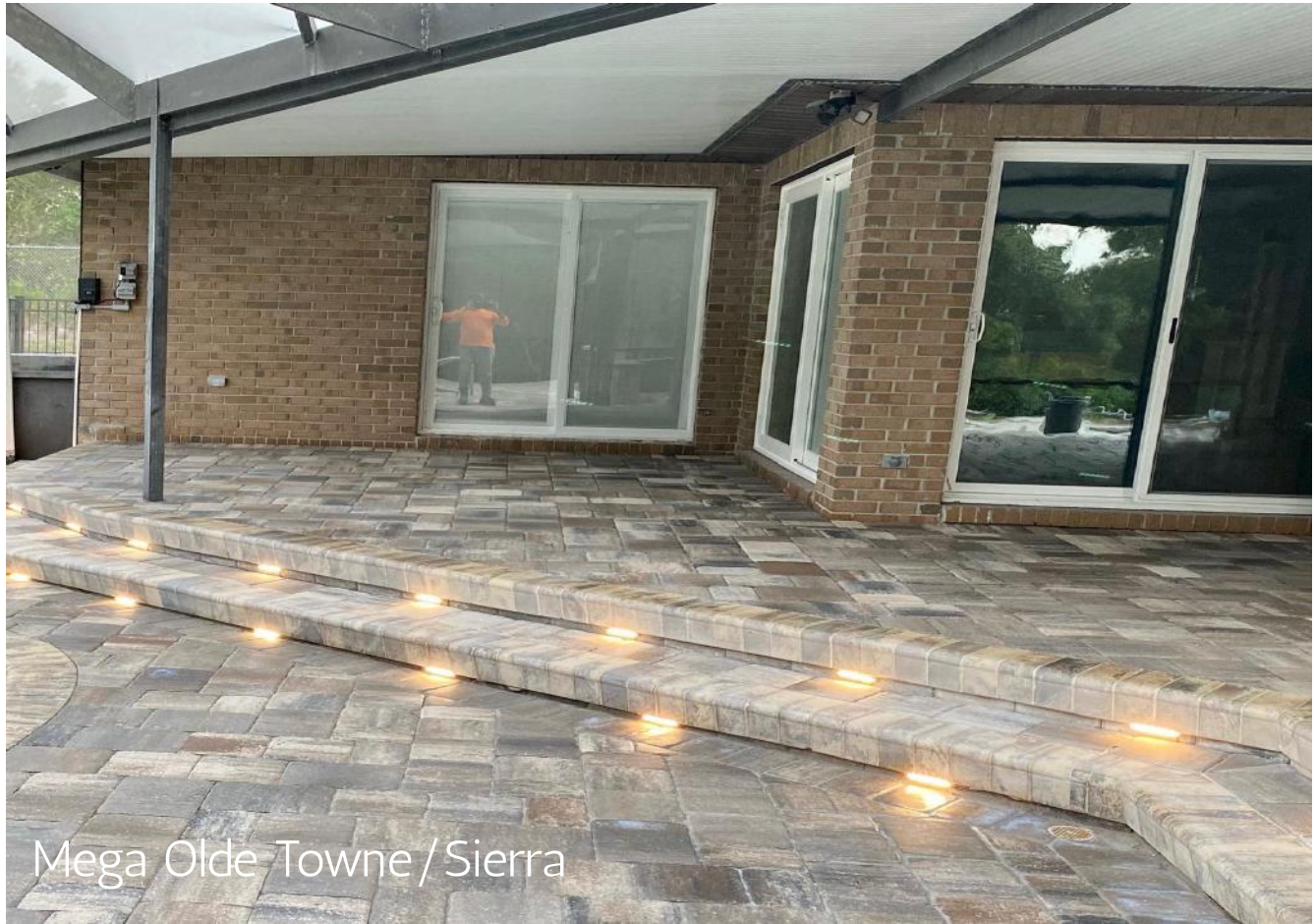
Mega Olde Towne / Sierra