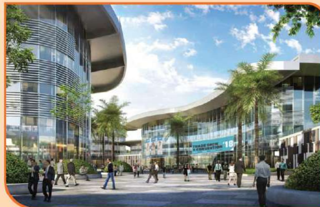
Trade Show Convention Center