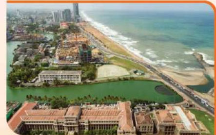
Galle Face Green