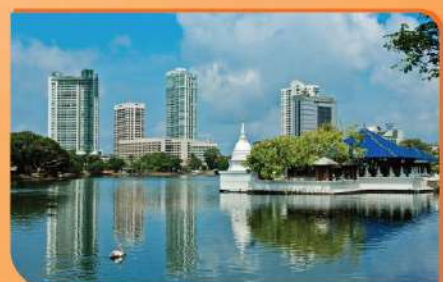
Beira Lake Colombo

Some of the major tourist places in Colombo that you should not skip are Beira Lake where you can experience adventure, pilgrimage & picnic at a single place; National Museum of Colombo where you can check artifacts and manuscripts in a beautiful building with Italian Architecture; and Gangaramaya Temple which is the most iconic Buddhist temple in Sri Lanka. Wildlife tours of Attidiya Bird Sanctuary & Dehiwala Zoo are highly recommended for adventure and wildlife lovers