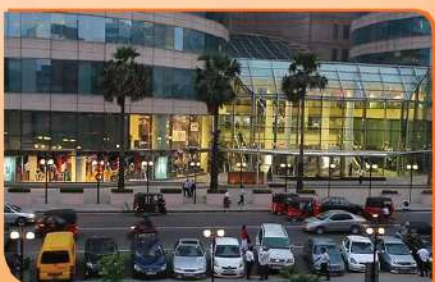
World Trade Center