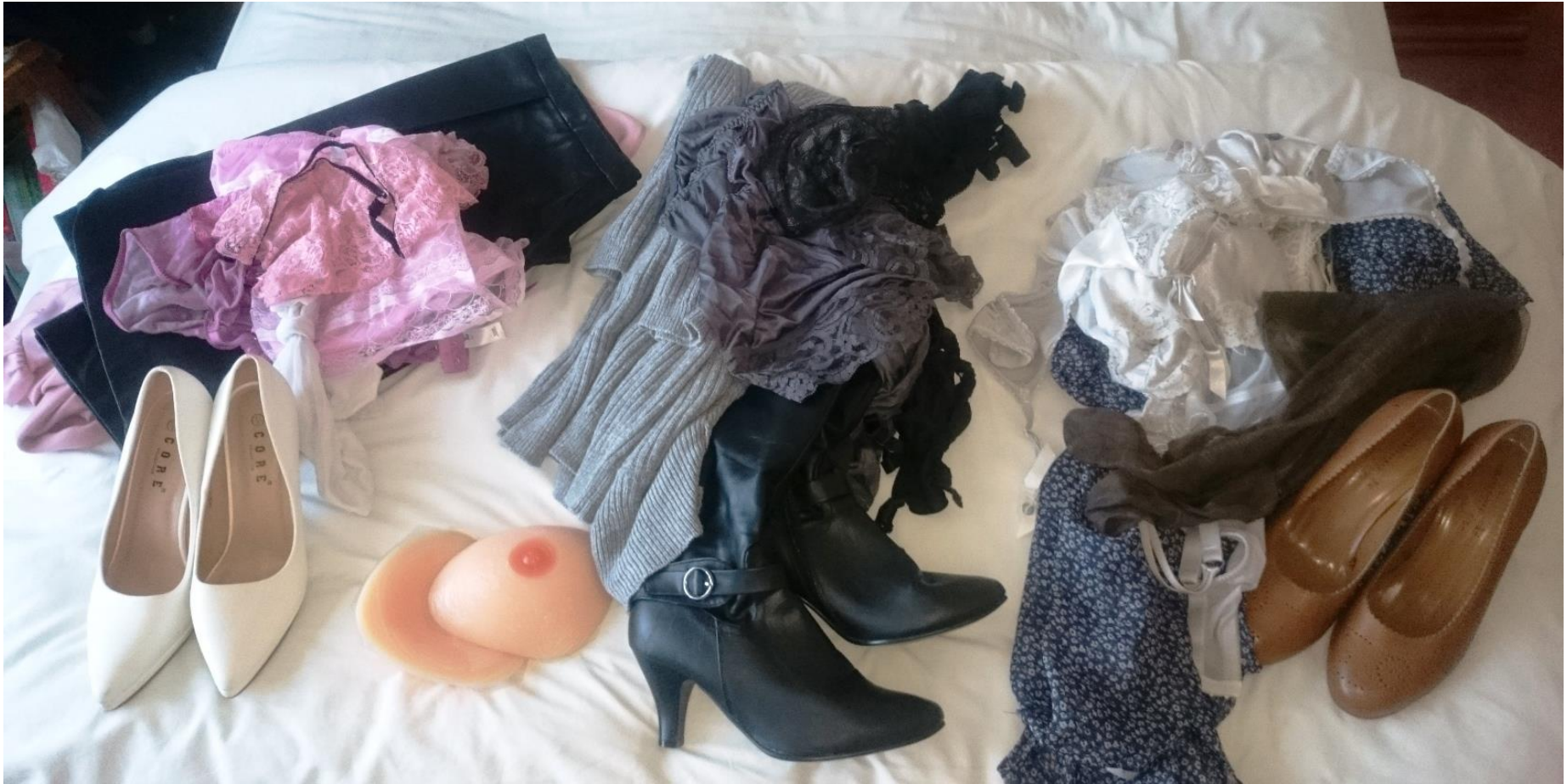
Three different outfits, each tell their own story