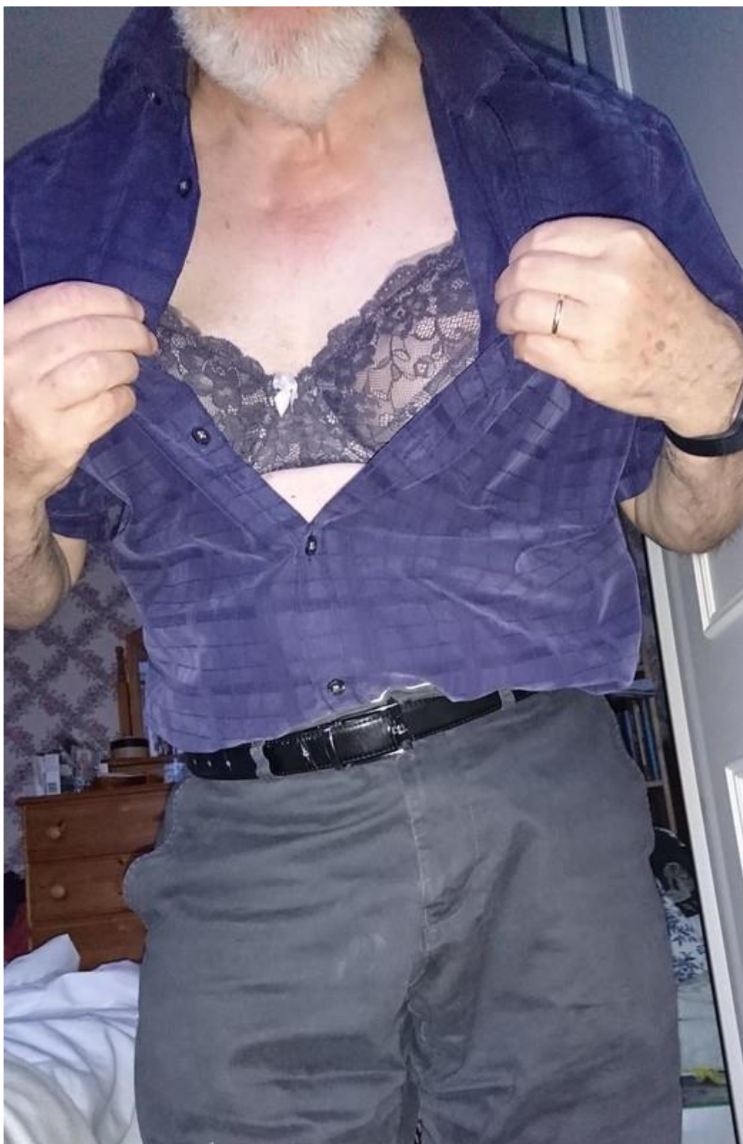
Sometimes she wears a lacy bra.