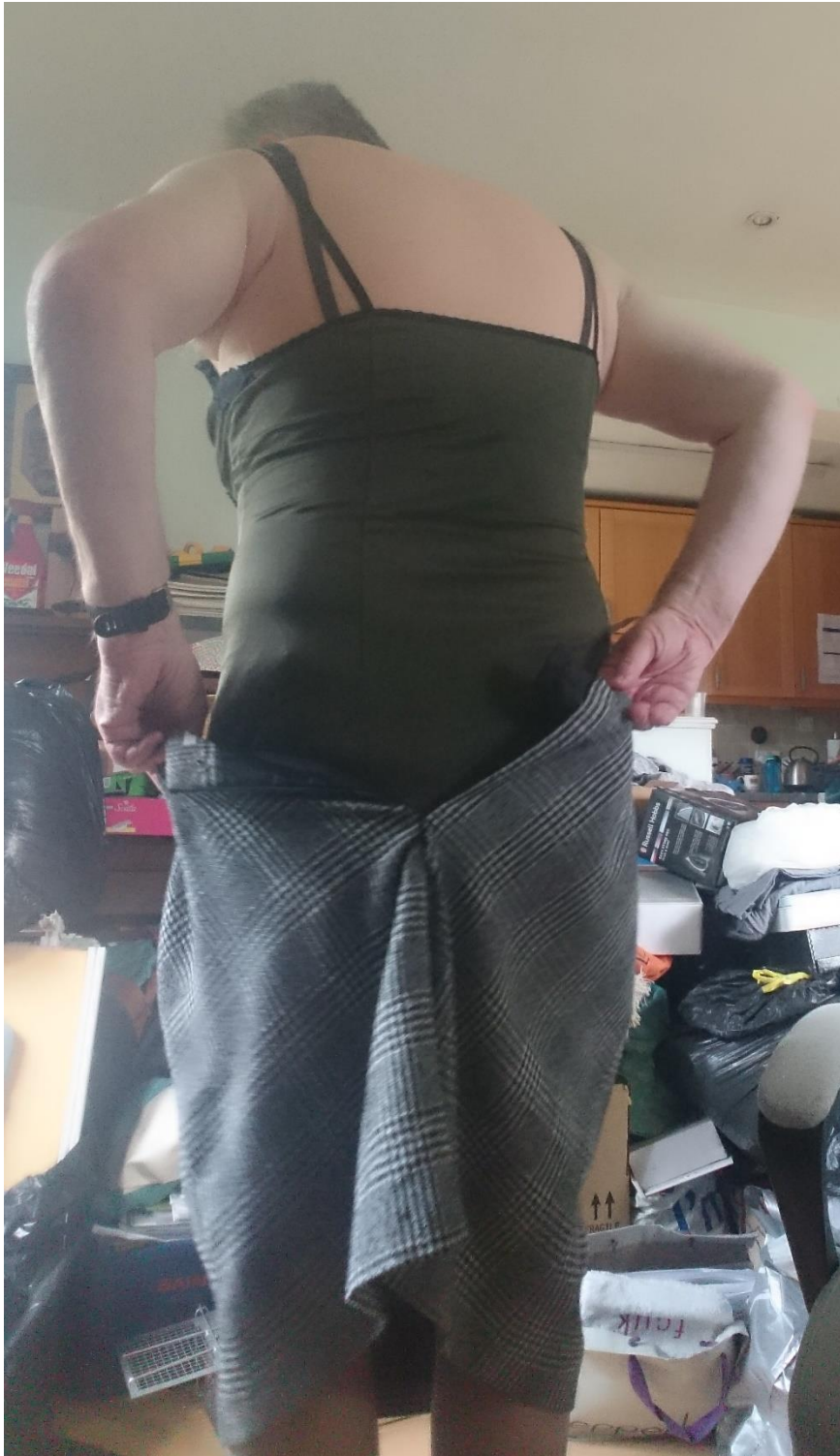
Miss Knicker stood up and removed her skirt and blouse.