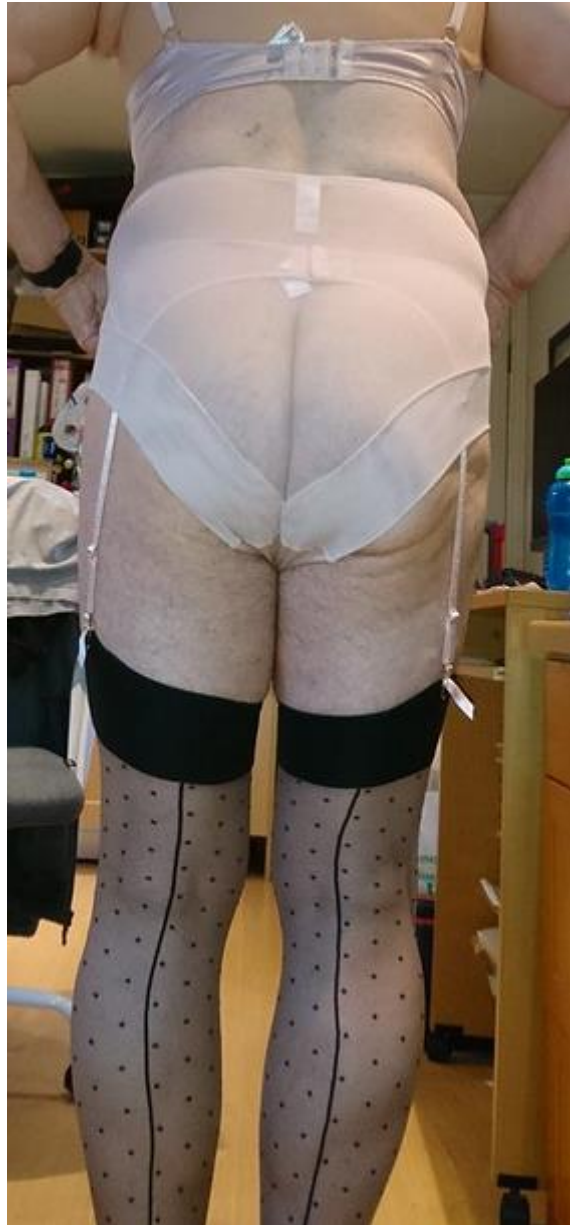
Jane's sheer pink panties came into view.