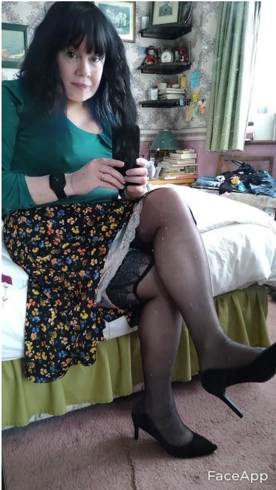
Here I am wearing the skirt with a green slip, a green top and black stockings.