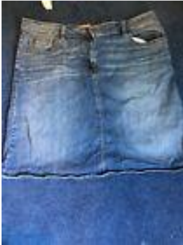
This is a blue denim skirt from eBay.