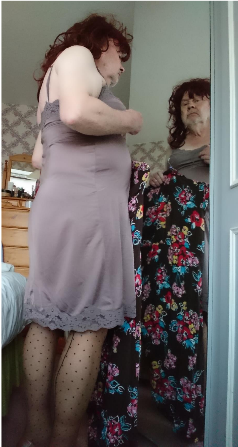
The stockings feel wonderful with my slip and dress, they make me feel so femme and excited.