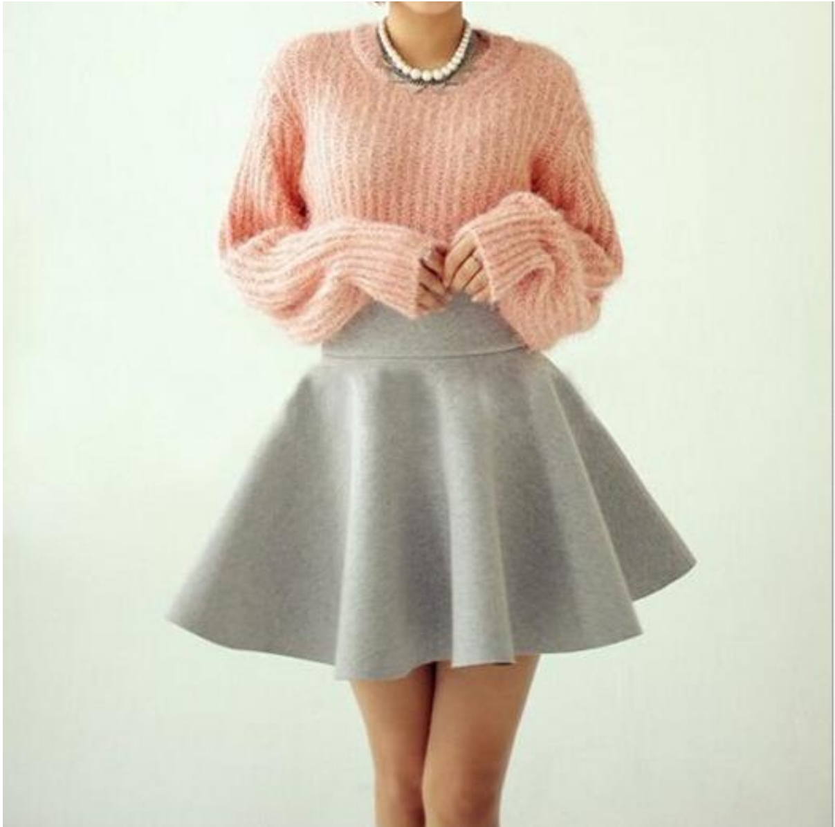
This is a cute short A—shape skirt in grey from eBay.