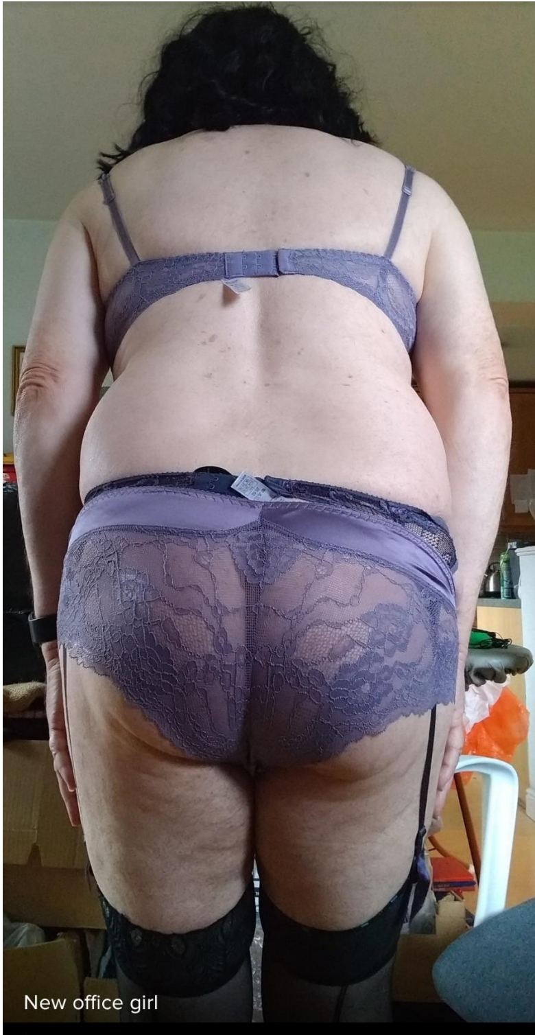
The back of the panties are very lacy.