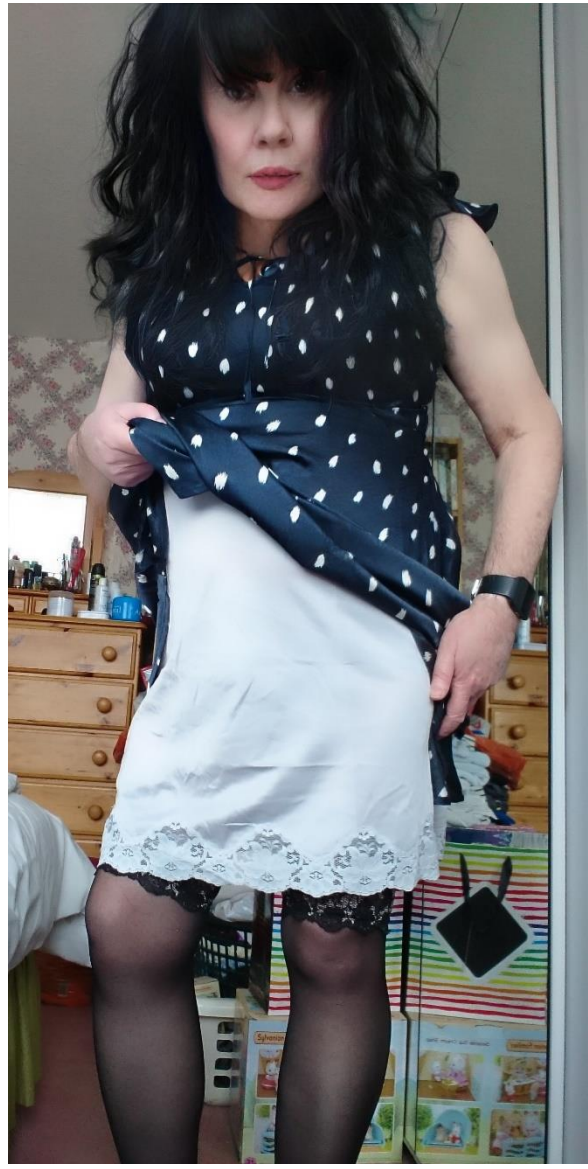
When I bought the dress, I thought it was actually black but as you can see from the photo it has a lovely navy-blue sheen to it. I wore it with a white full slip that peeps out over my black stockings.