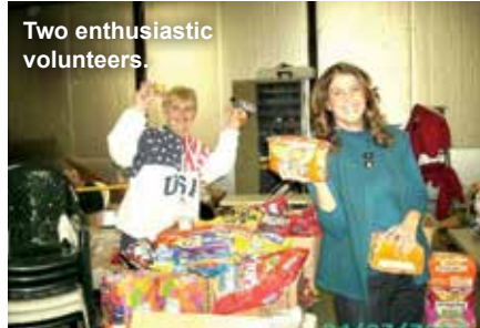
Two enthusiastic volunteers.