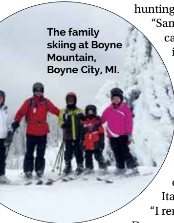
The family skiing at Boyne Mountain, Boyne City, MI.