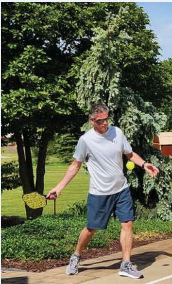
PICKLEBALL...A NEWFOUND HOBBY.

The Lawsons enjoy all that Valparaiso has to offer and especially enjoy the YMCA, Central Park Plaza, ice rink, and biking around town. They also like to paddleboard on Long Lake and Flint Lake where on one serendipitous day they spotted a bald eagle. "It flew over our heads with a fish in its talons," recalls Chrys. "It was like a National Geographic moment!"