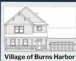
Village of Burns Harbor