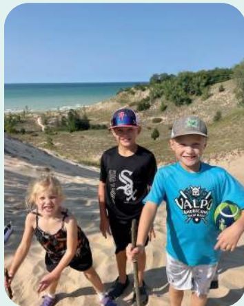
Climbing the dunes.

DO YOU KNOW A NEIGHBOR WHO HAS A STORY TO SHARE? Nominate your neighbor to be featured in one of our upcoming issues! Contact us at cwooten@bestversionmedia.com .