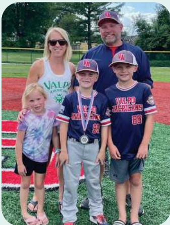
Baseball is a family affair.