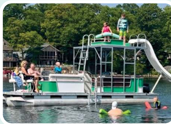
Fun on the double decker!