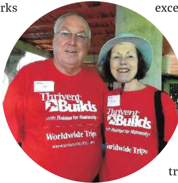
Volunteering in Costa Rica.

helped build with Habitat for Humanity in every continent except Australia!”