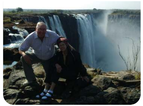
Elephant safari in Africa; Victoria Falls, Africa; European adventures.