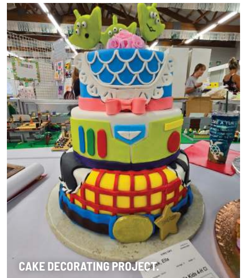
CAKE DECORATING PROJECT.