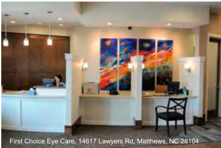
First Choice Eye Care, 14617 Lawyers Rd, Matthews, NC 28104