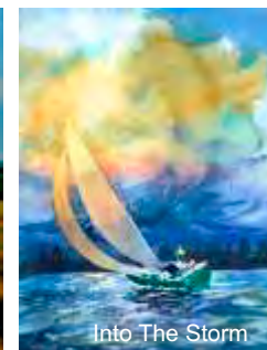
Into The Storm