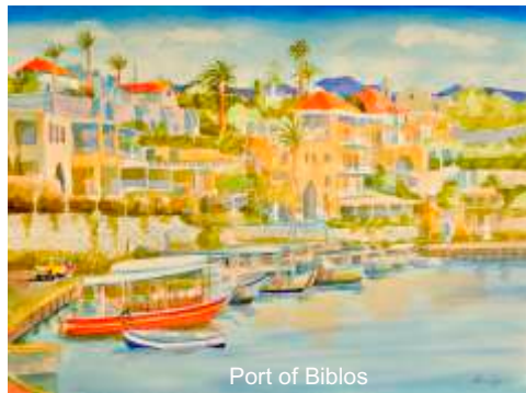
Port of Biblos