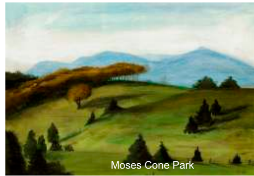
Moses Cone Park