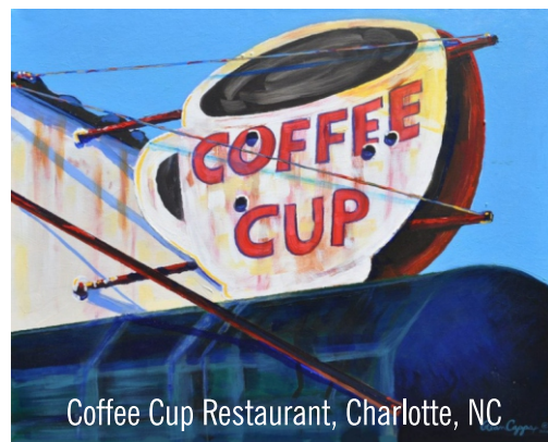
Coffee Cup Restaurant, Charlotte, NC