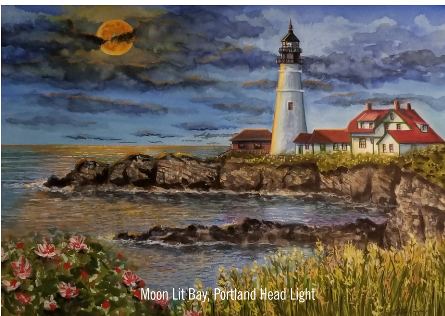
Moon Lit Bay, Portland Head Light