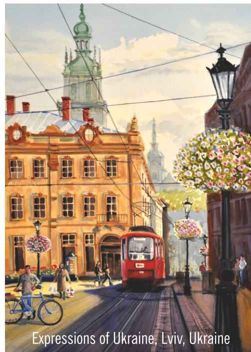
Expressions of Ukraine, Lviv, Ukraine