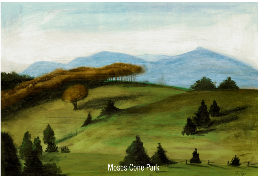
Moses Cone Park