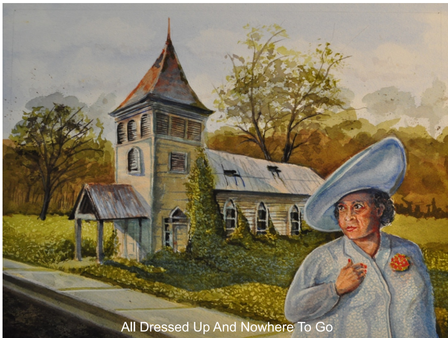
All Dressed Up And Nowhere To Go