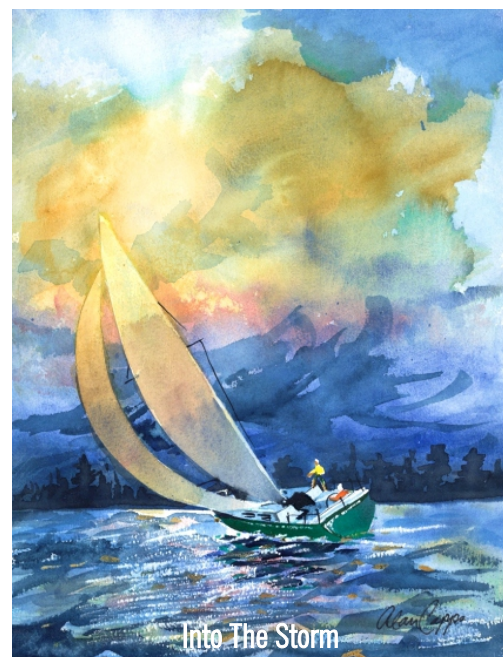
Into The Storm