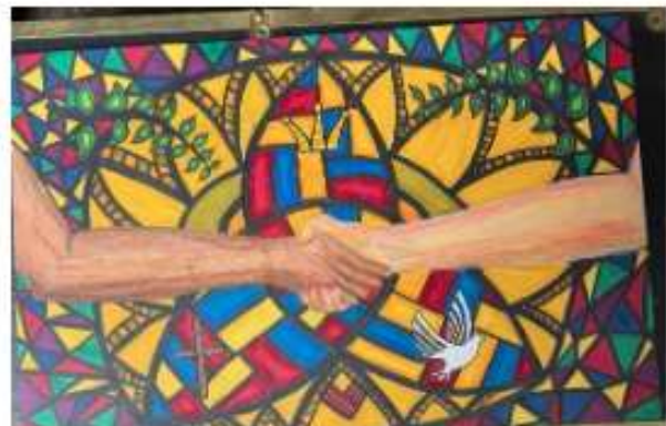
Jeff City Host (and district winning) poster